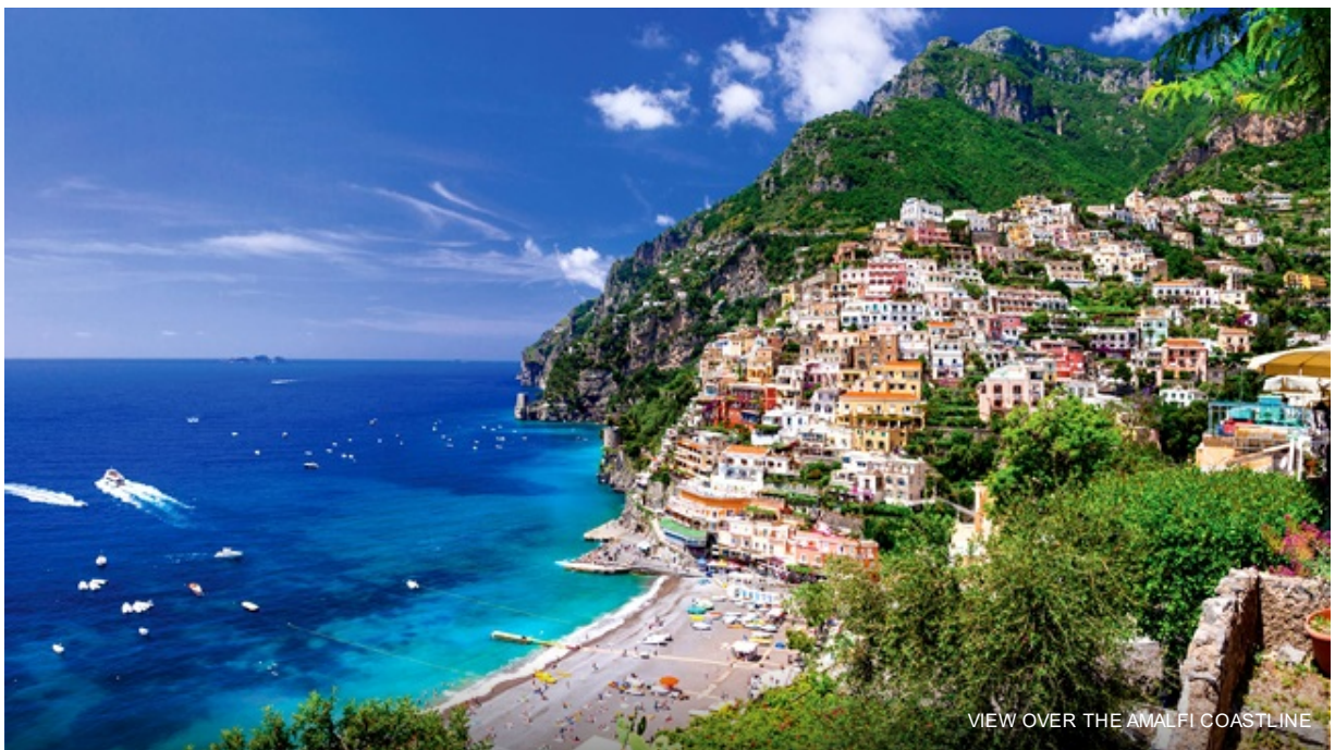
VIEW OVER THE AMALFI COASTLINE