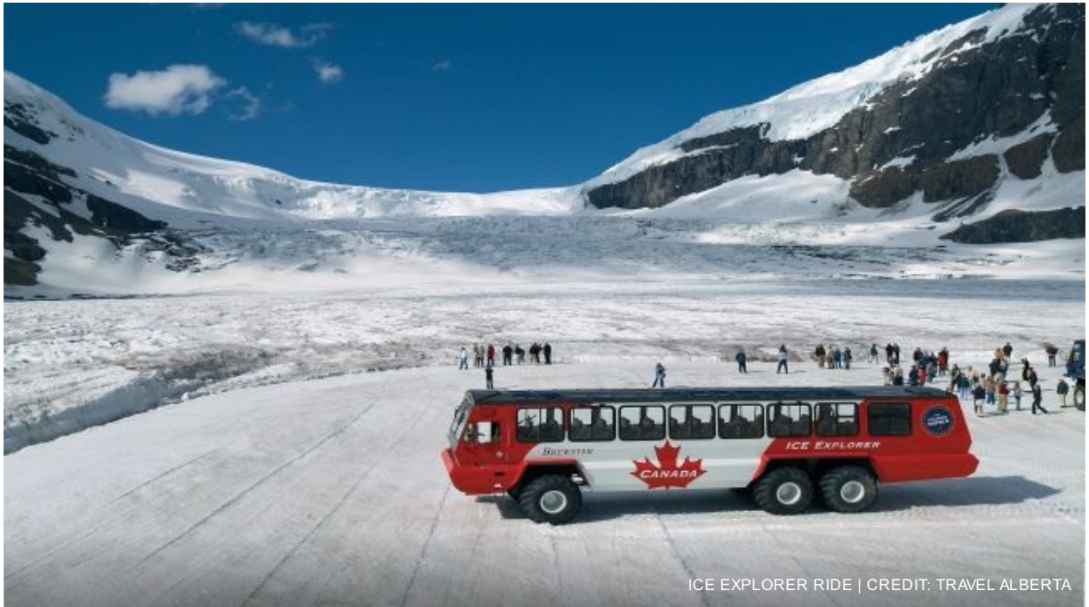
ICE EXPLORER RIDE

Overnight in Banff at Fairmont Banff Springs Hotel