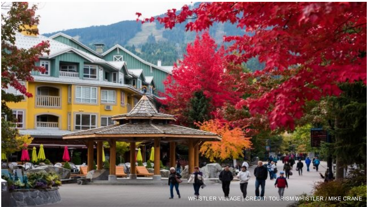
WHISTLER VILLAGE