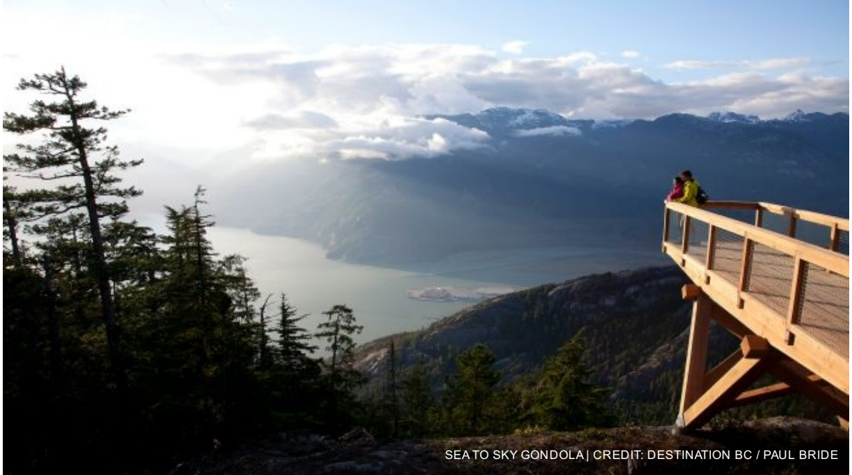
SEA TO SKY GONDOLA