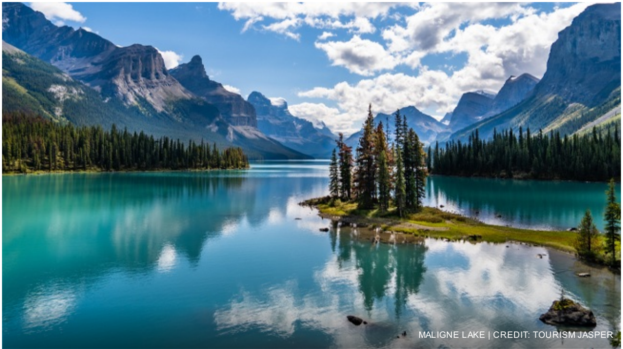
MALIGNE LAKE