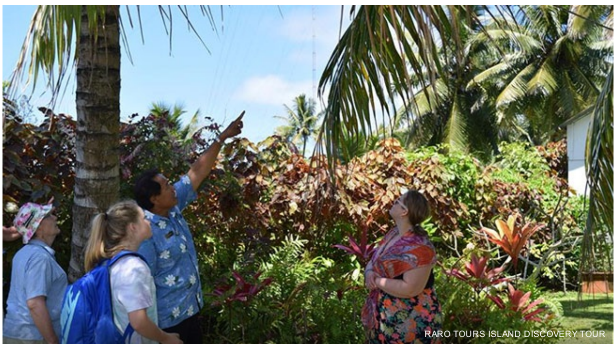
RARO TOURS ISLAND DISCOVERY TOUR

In the comfort of an air-conditioned vehicle this 3-hour guided tour is a brilliant way to kickstart your holiday before exploring the island on your own. On tour you will discover many places of interest around Rarotonga including popular beaches, cultural and historical sites, local plantations, gift shops and more. Light refreshments provided at the completion of your tour.