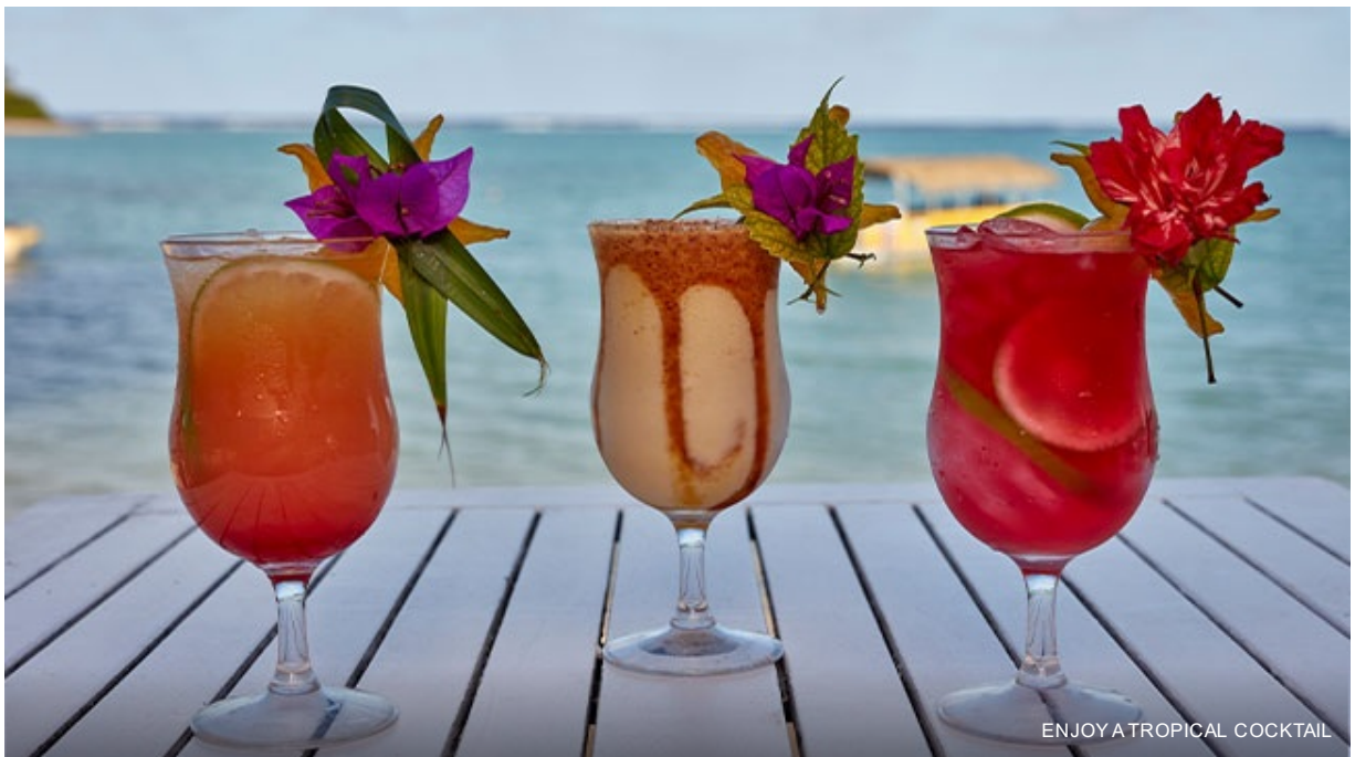
ENJOY A TROPICAL COCKTAIL