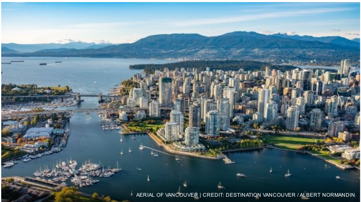
AERIAL OF VANCOUVER

Leaving Victoria, drive north to Swartz Bay Ferry Terminal for a 90-minute ferry ride to Tsawwassen. On-board BC Ferries enjoy the scenery of the Gulf Islands as you cross the Strait of Georgia. From Tsawwassen, continue on to downtown Vancouver where your self-drive package ends.