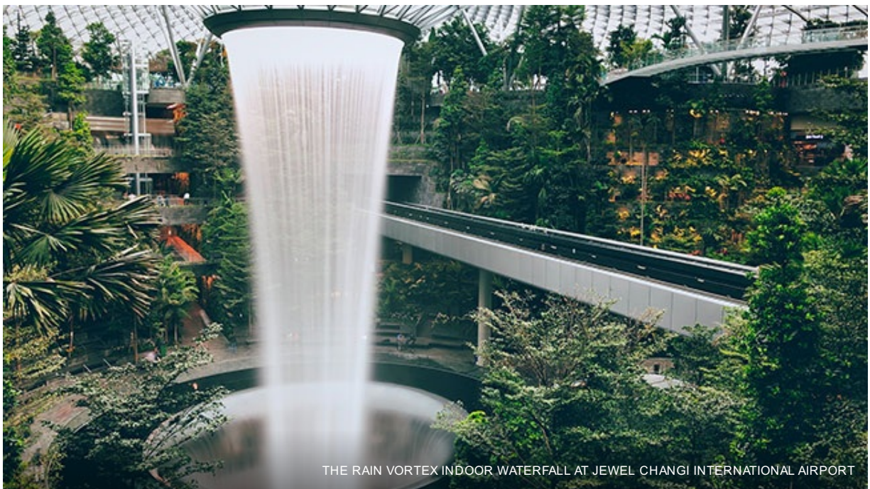
THE RAIN VORTEX INDOOR WATERFALL AT JEWEL CHANGI INTERNATIONAL AIRPORT