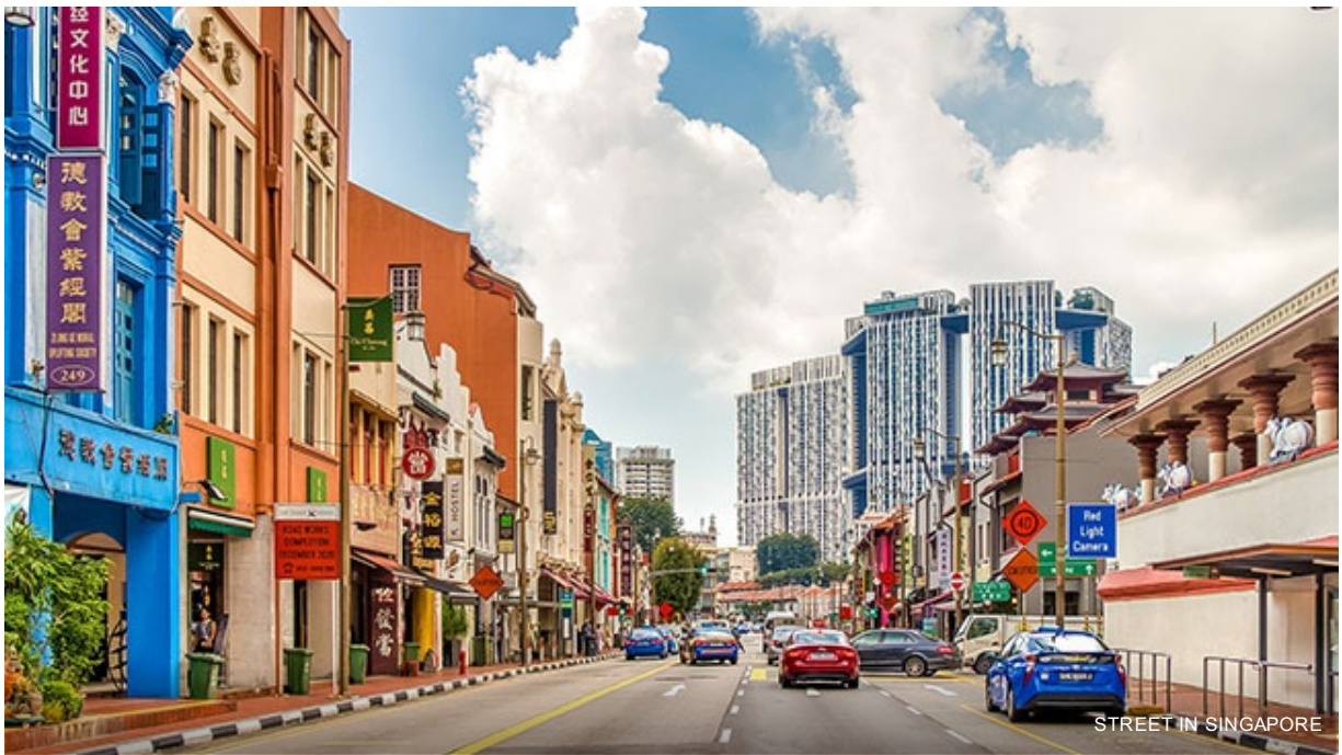
STREET IN SINGAPORE