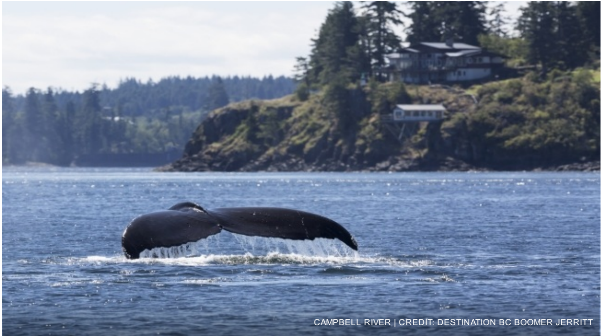
CAMPBELL RIVER

Overnight in Campbell River at the Comfort Inn & Suites