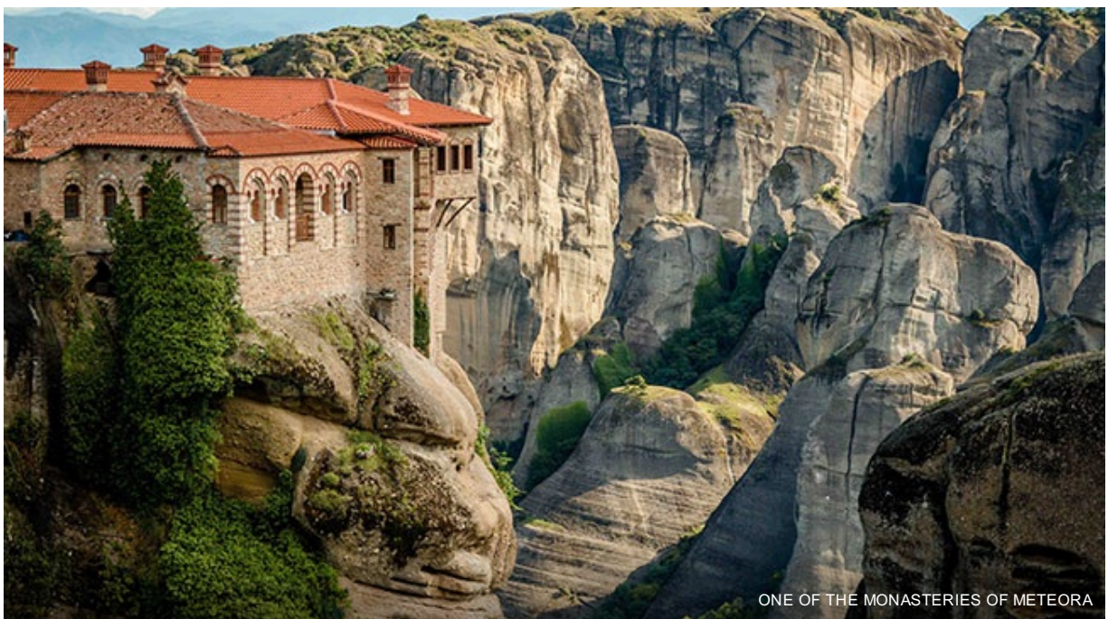
ONE OF THE MONASTERIES OF METEORA