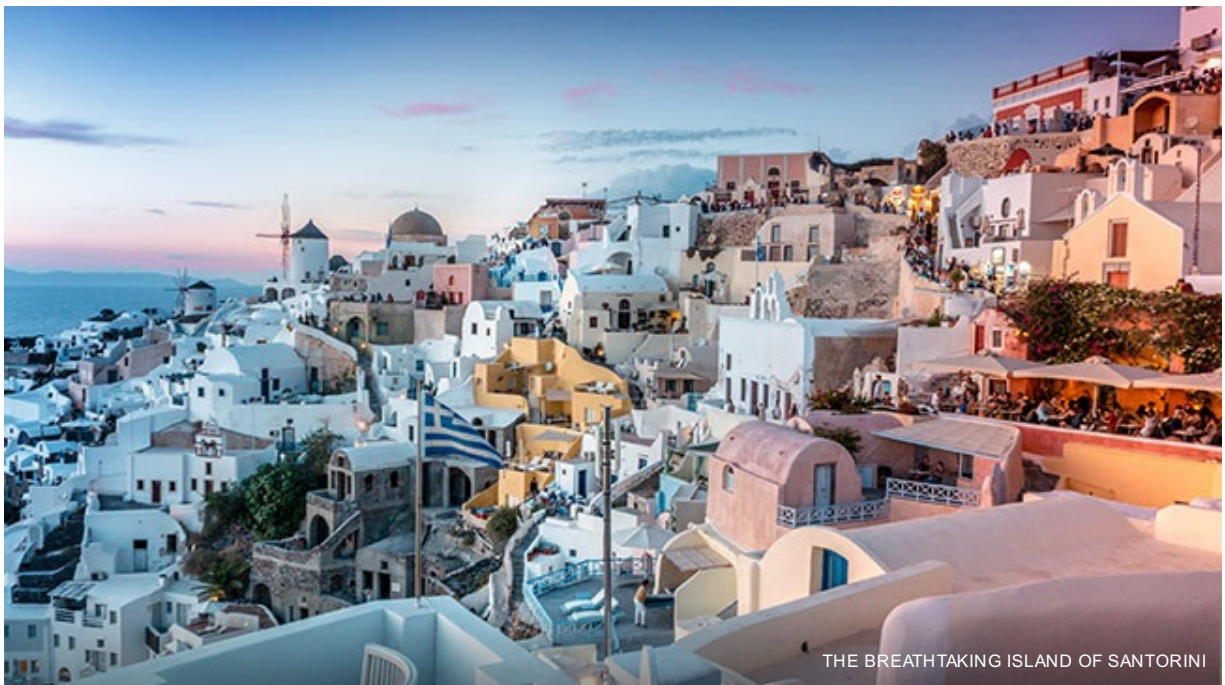
THE BREATHTAKING ISLAND OF SANTORINI