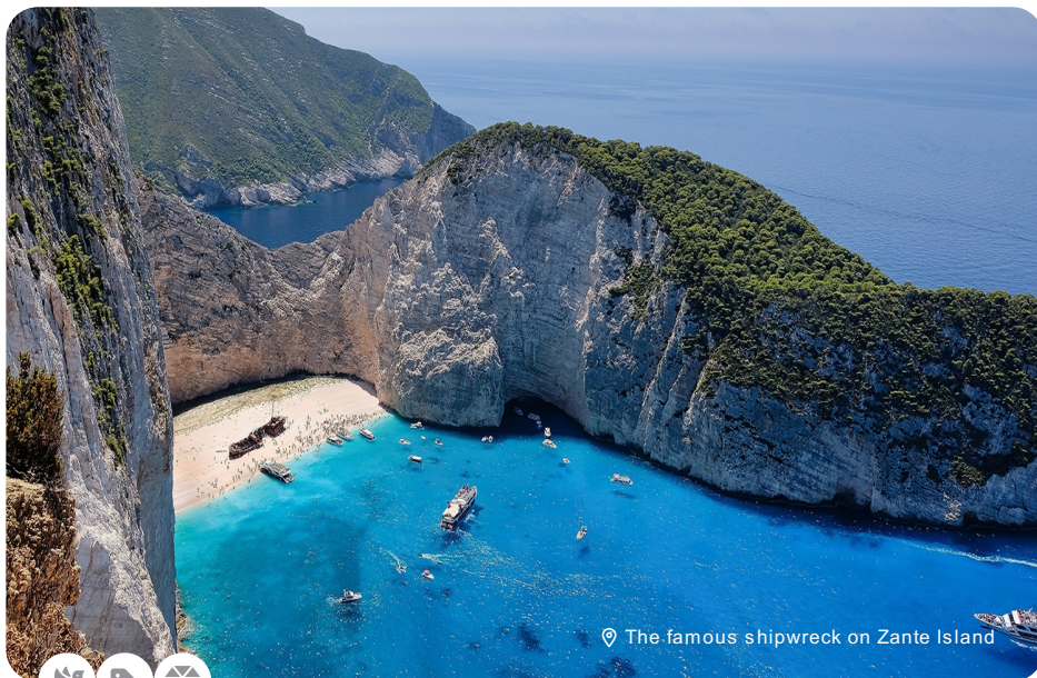
The famous shipwreck on Zante Island