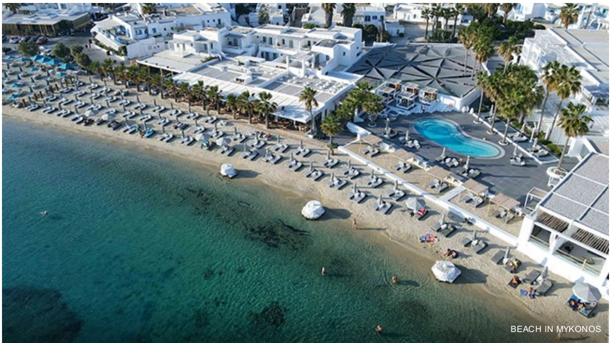
BEACH IN MYKONOS