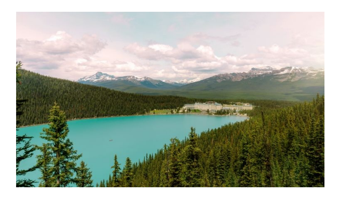
Elk + Avenue Hotel