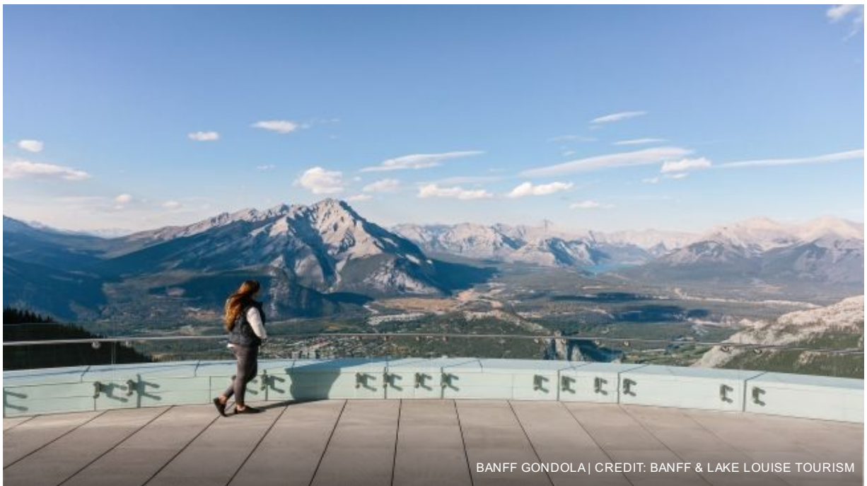
BANFF GONDOLA