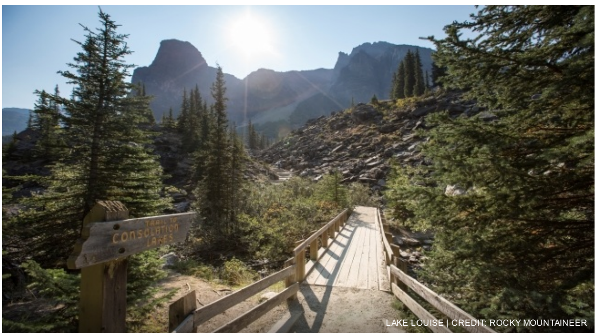
LAKE LOUISE

Overnight in Lake Louise at the Fairmont Chateau Lake Louise