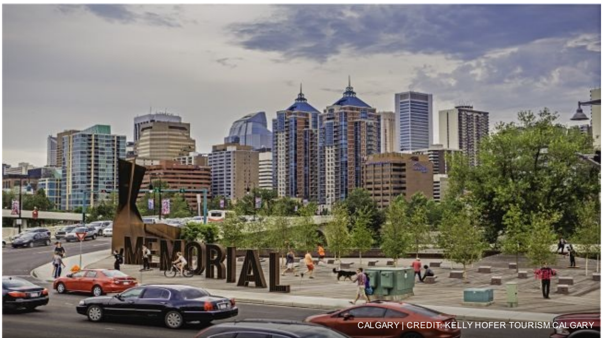
CALGARY

Overnight in Calgary at the Fairmont Palliser