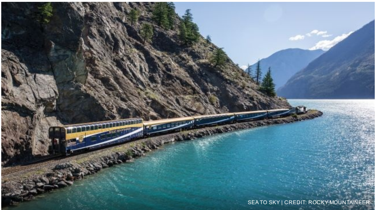
SEA TO SKY