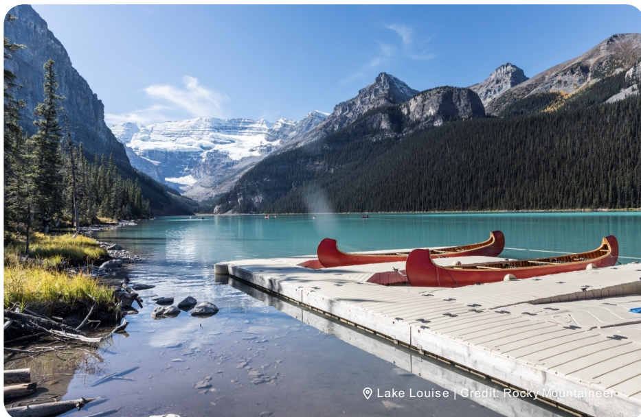
📍 Lake Louise