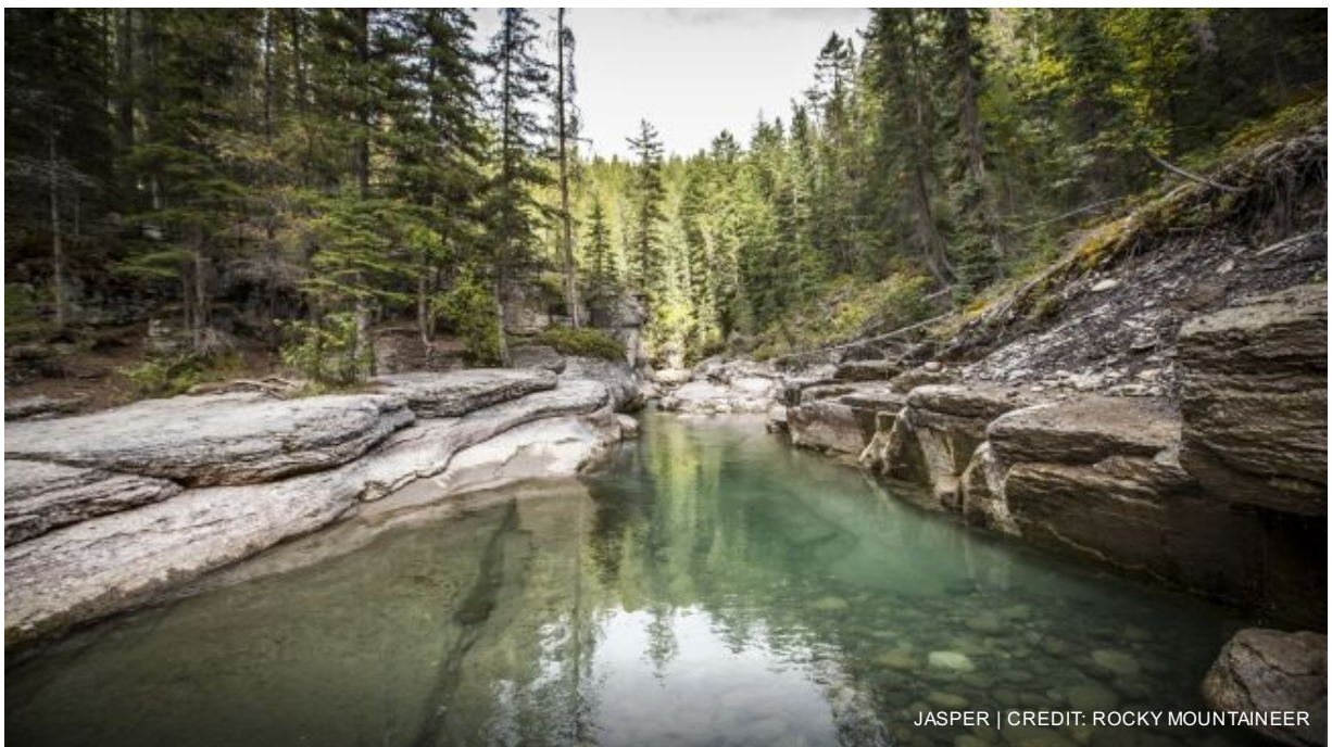
JASPER

Overnight in Jasper at the Fairmont Jasper Park Lodge