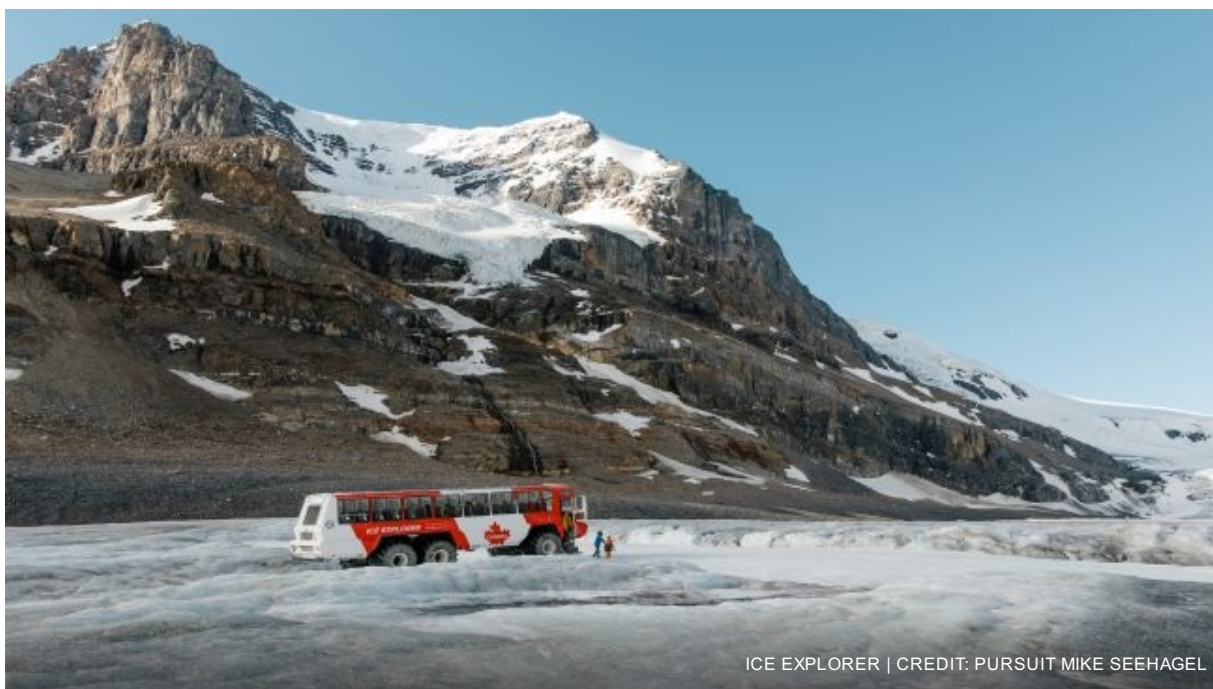
ICE EXPLORER