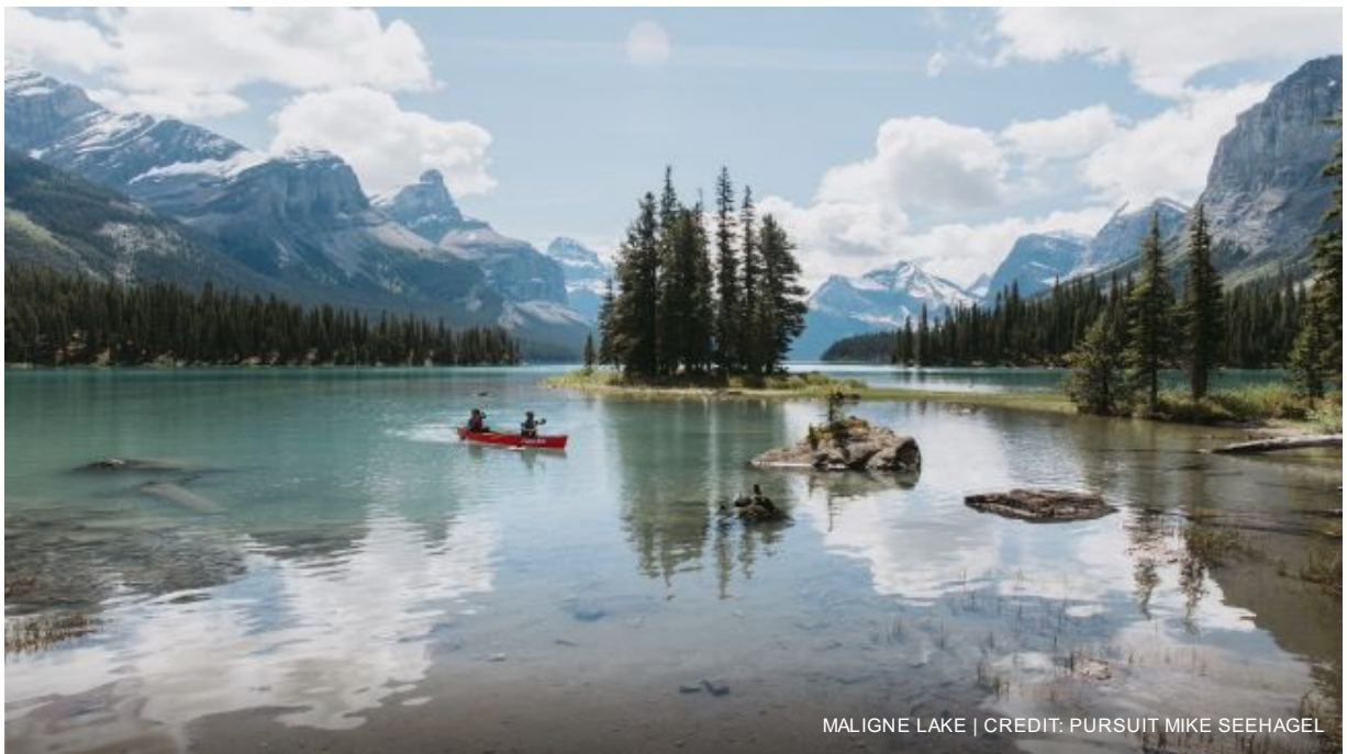
MALIGNE LAKE