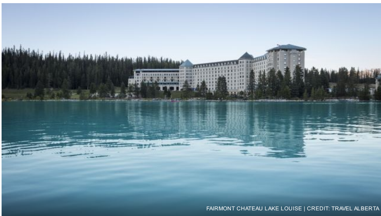
FAIRMONT CHATEAU LAKE LOUISE

Overnight in Lake Louise at the Fairmont Chateau Lake Louise