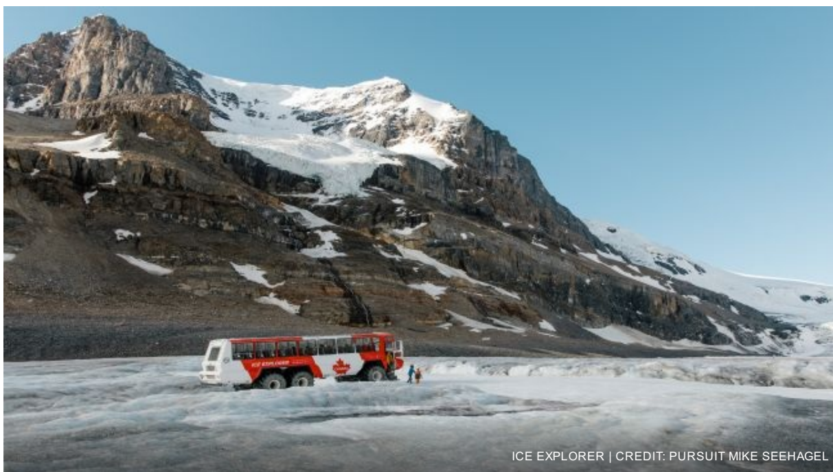
ICE EXPLORER