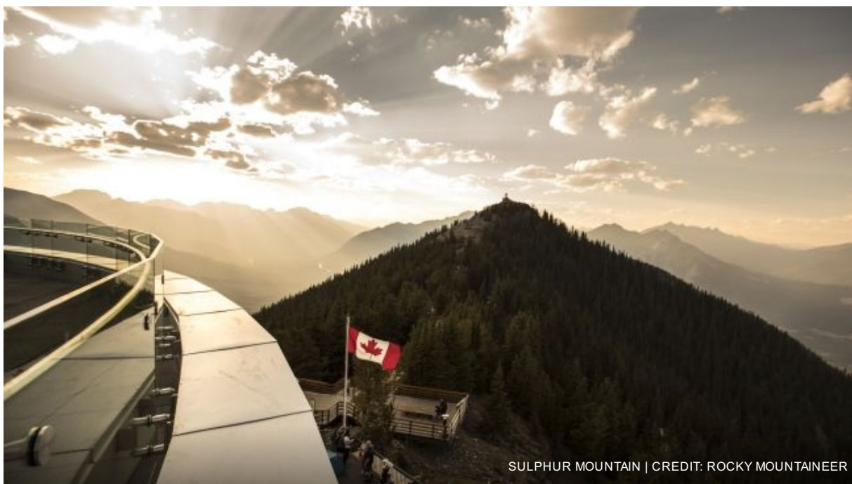
SULPHUR MOUNTAIN

Overnight in Calgary at the Fairmont Palliser (or similar)