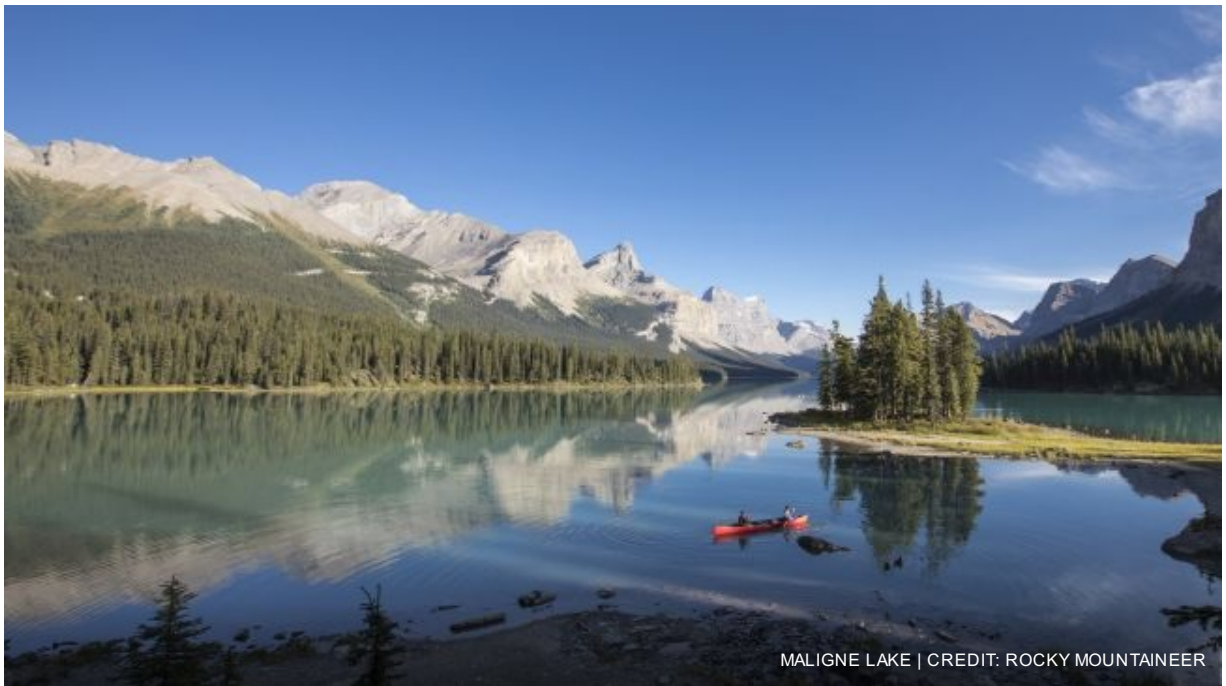
MALIGNE LAKE

Overnight in Jasper at the Fairmont Jasper Park Lodge (or similar)