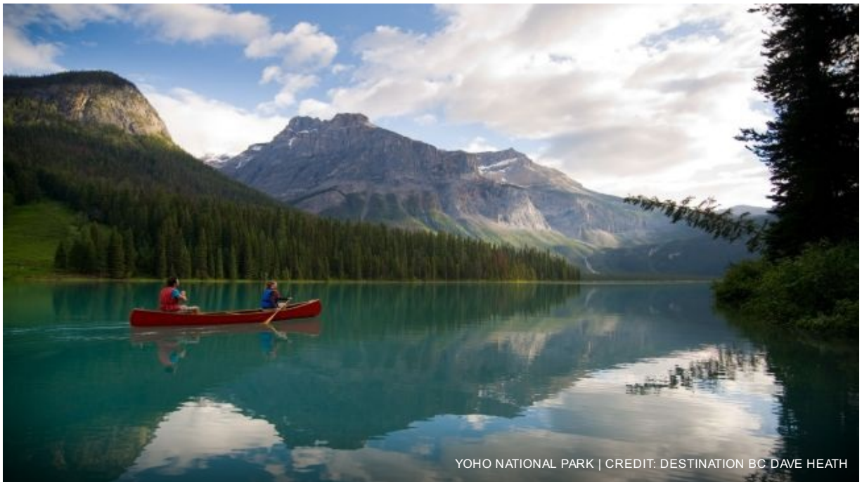
YOHO NATIONAL PARK

Overnight in Banff at Banff Caribou Lodge & Spa