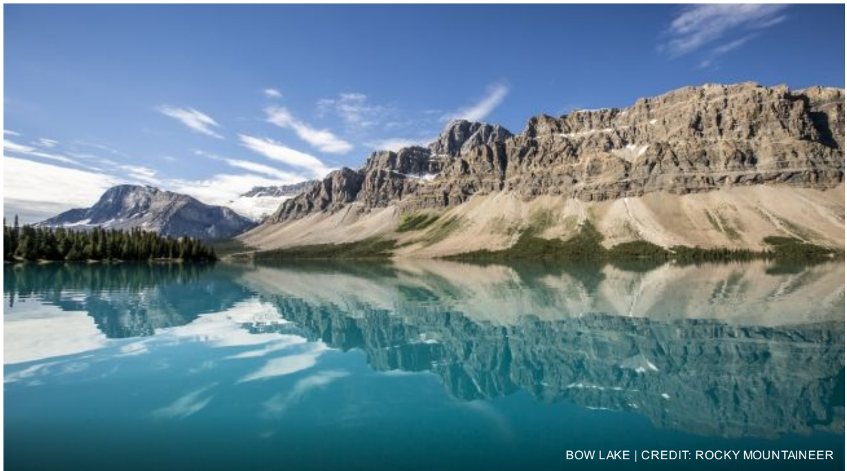
BOW LAKE

Saddle up for a journey through the celebrated landscape of Banff National Park on this guided horseback riding adventure.