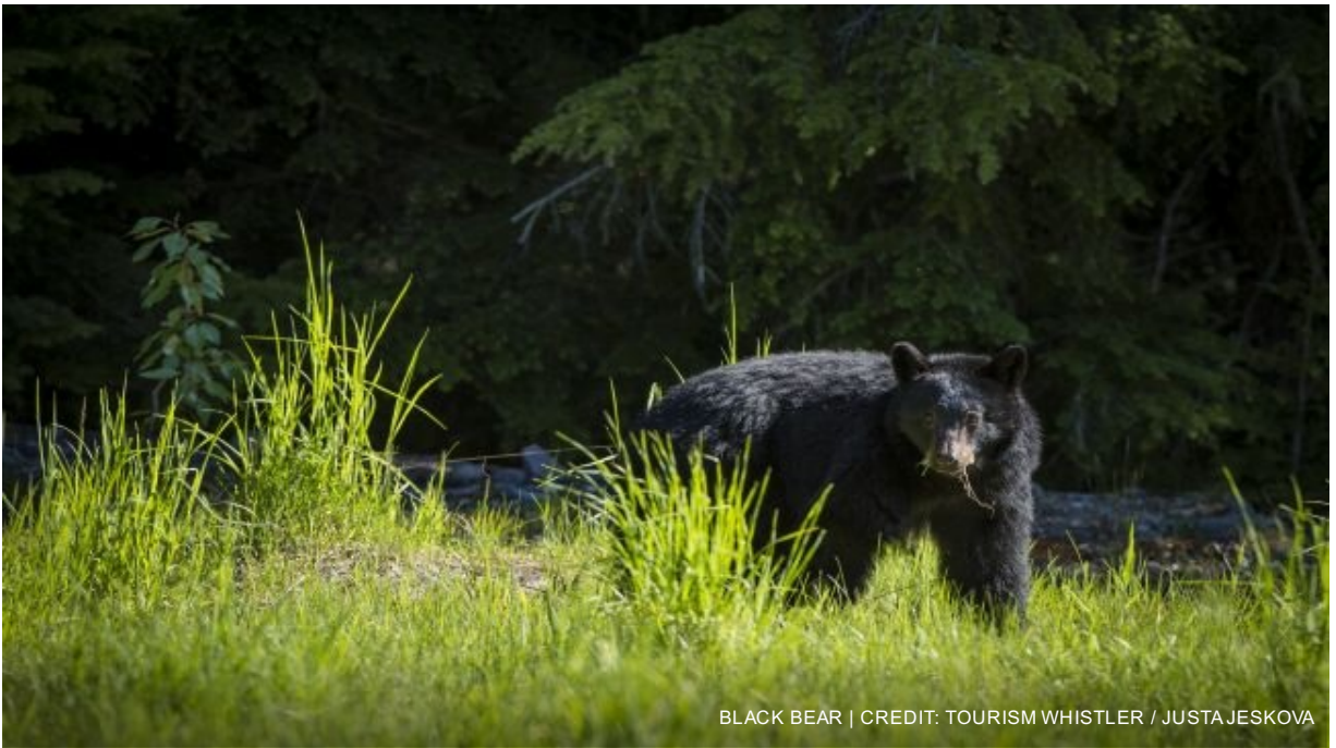
BLACK BEAR