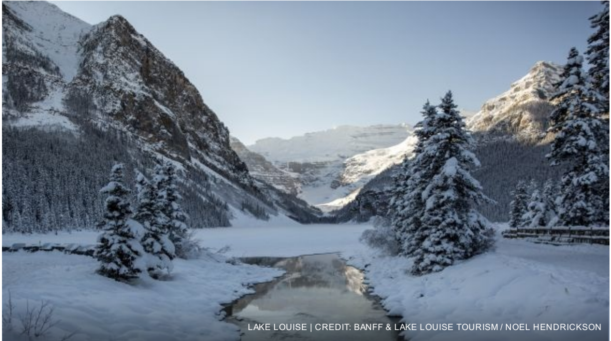
LAKE LOUISE

Overnight in Banff at Fairmont Banff Springs .