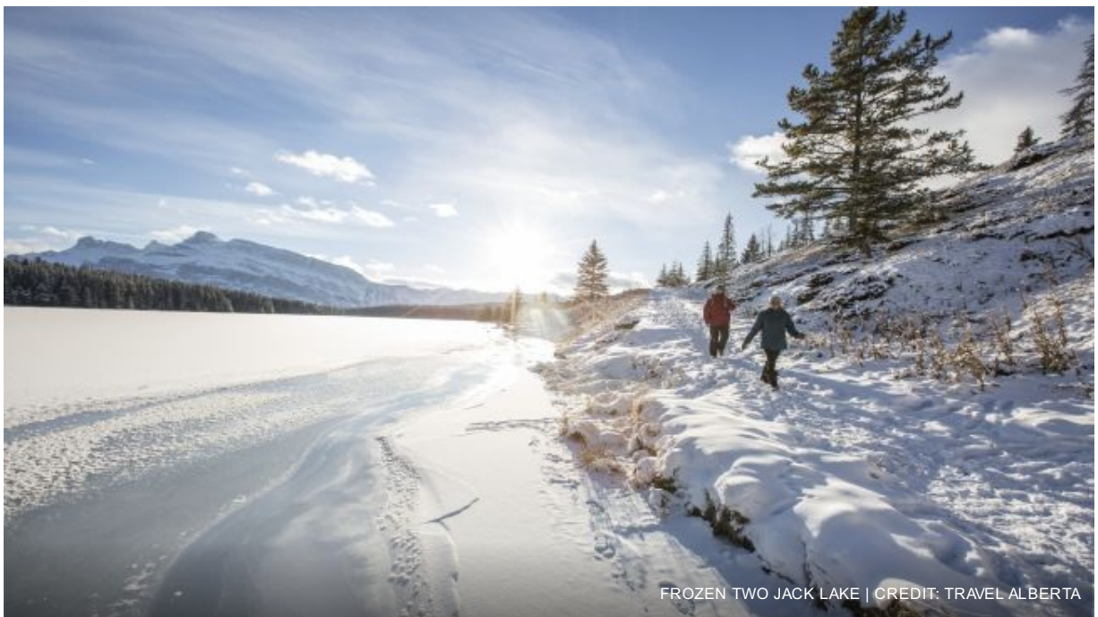
FROZEN TWO JACK LAKE

Overnight in Banff at Fairmont Banff Springs .