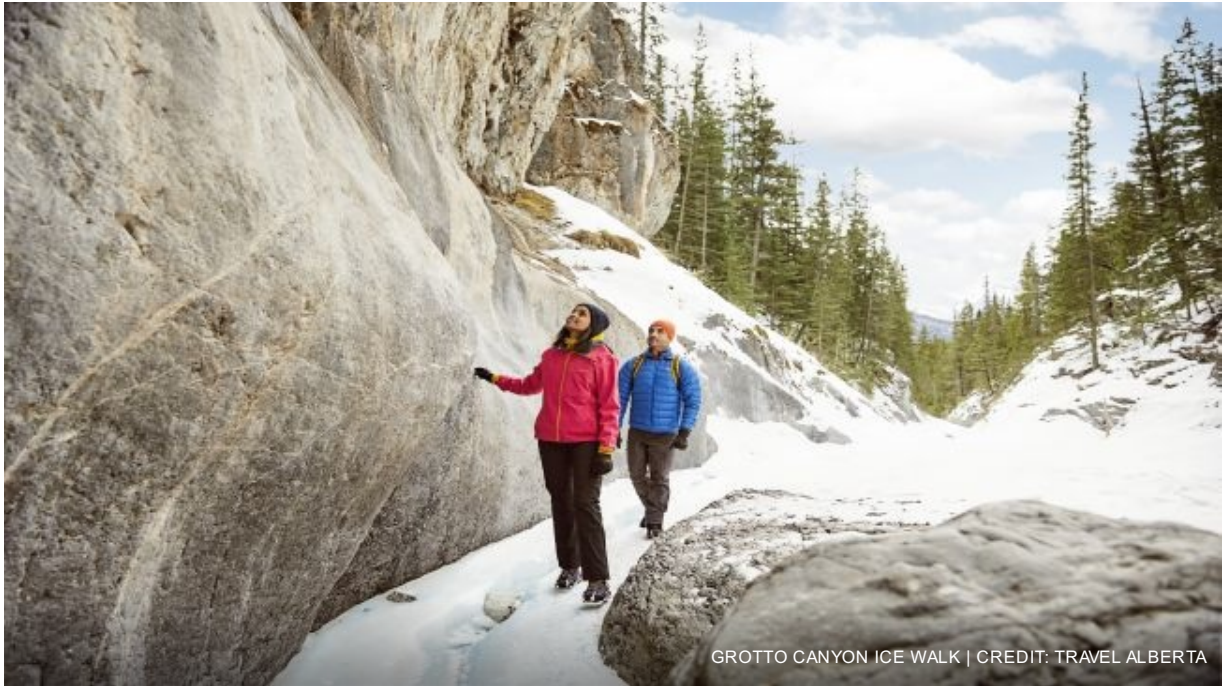
GROTTO CANYON ICE WALK

Overnight in Banff at Fairmont Banff Springs .