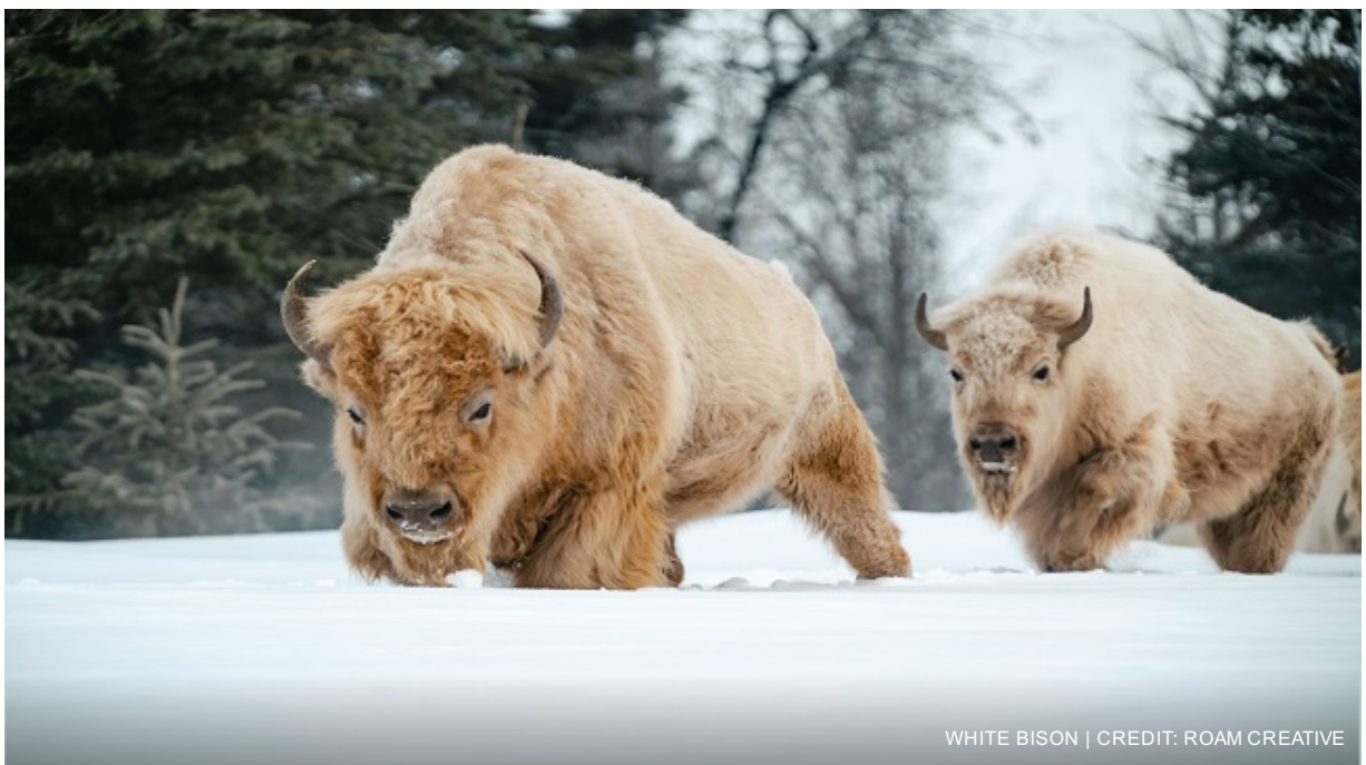
WHITE BISON