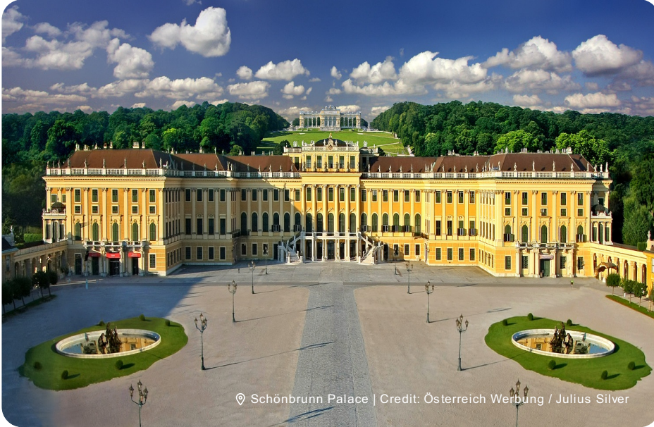
📍 Schönbrunn Palace