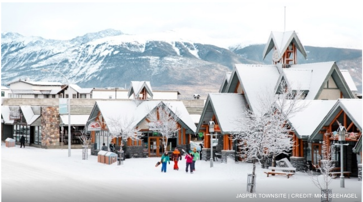
JASPER TOWNSITE