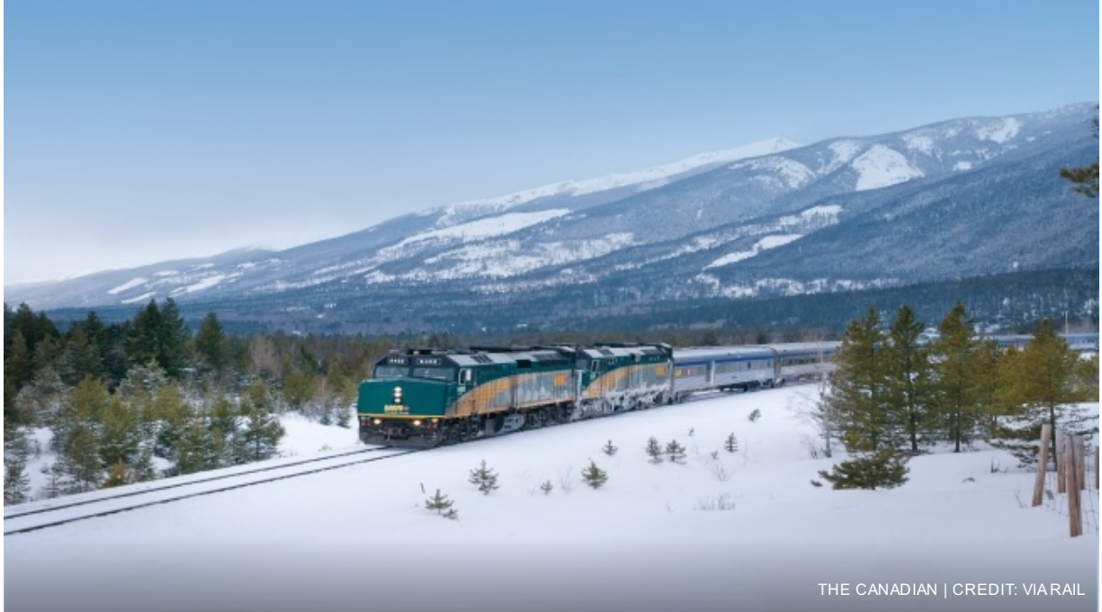
THE CANADIAN