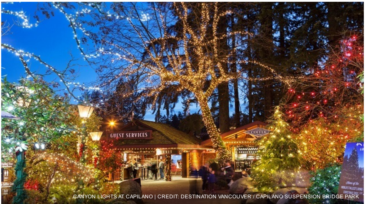
CANYON LIGHTS AT CAPILANO

Overnight in Vancouver at the Sutton Place Hotel