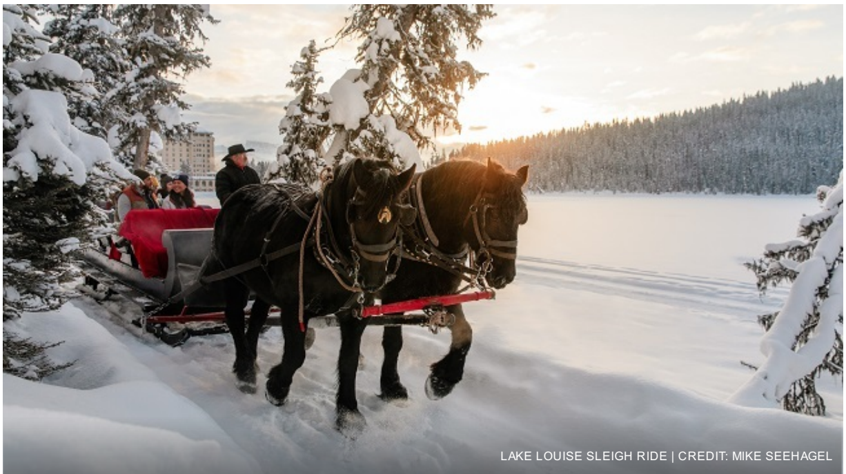
LAKE LOUISE SLEIGH RIDE