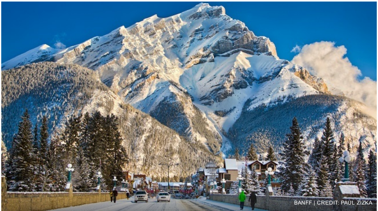
BANFF

Overnight stay in Banff at Banff Caribou Lodge (or similar)