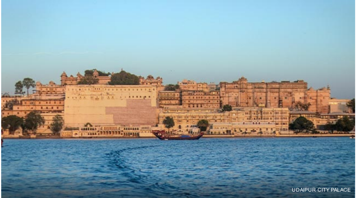
UDAIPUR CITY PALACE