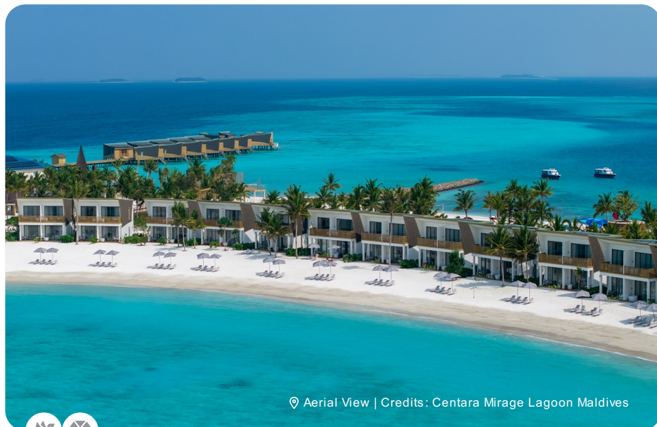
📍 Aerial View