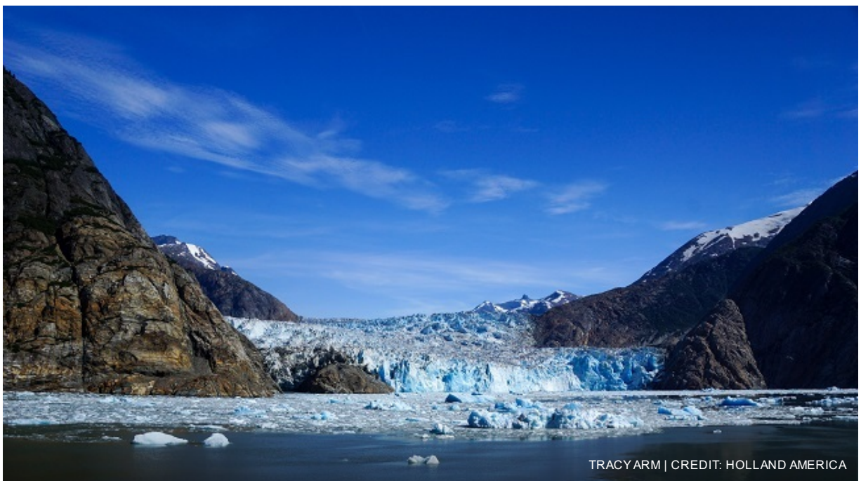
TRACY ARM