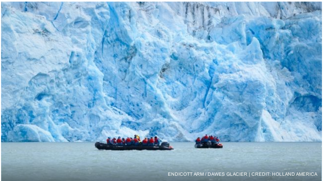
ENDICOTT ARM / DAWES GLACIER | CREDIT: HOLLAND AMERICA