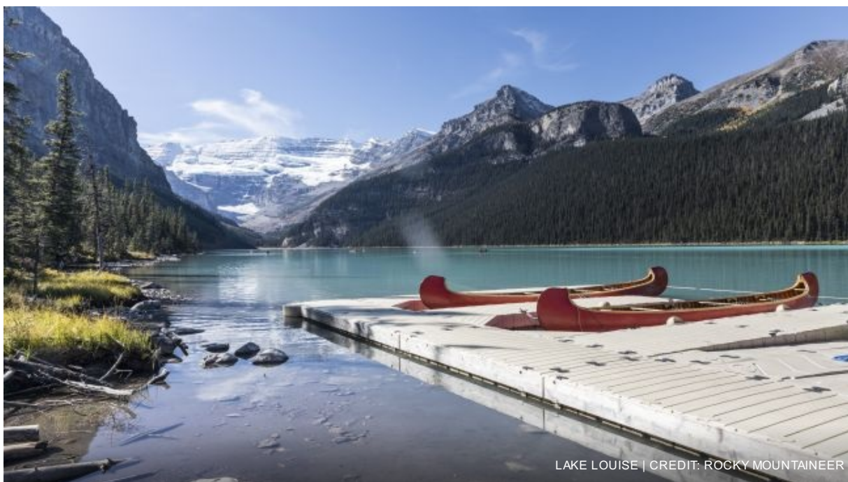
LAKE LOUISE | CREDIT: ROCKY MOUNTAINEER