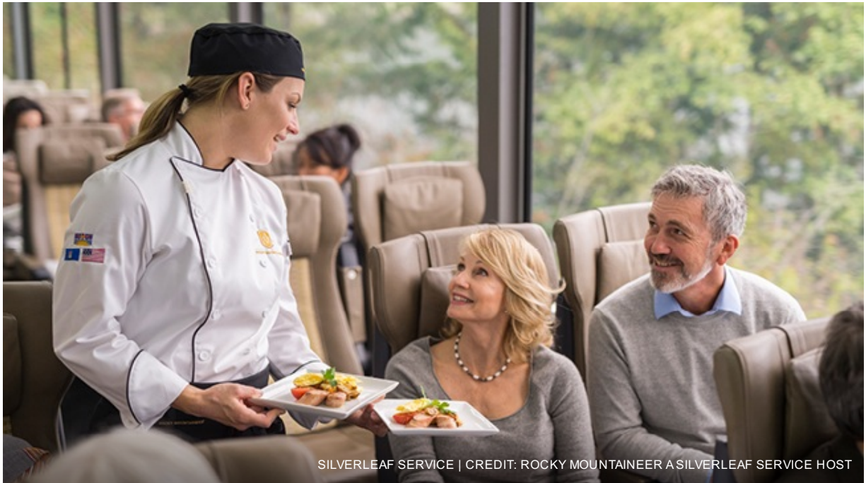
SILVERLEAF SERVICE | CREDIT: ROCKY MOUNTAINEER A SILVERLEAF SERVICE HOST