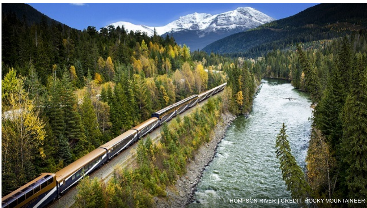
THOMPSON RIVER