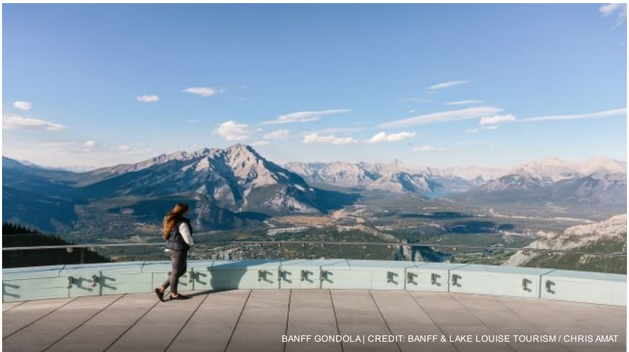
BANFF GONDOLA