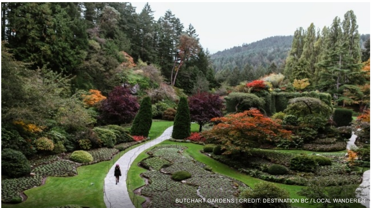
BUTCHART GARDENS