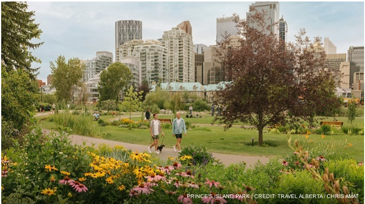
PRINCE'S ISLAND PARK

Overnight in Calgary at Delta Calgary Downtown