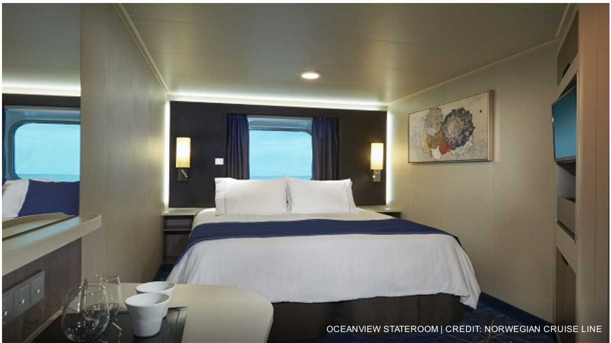
OCEANVIEW STATEROOM