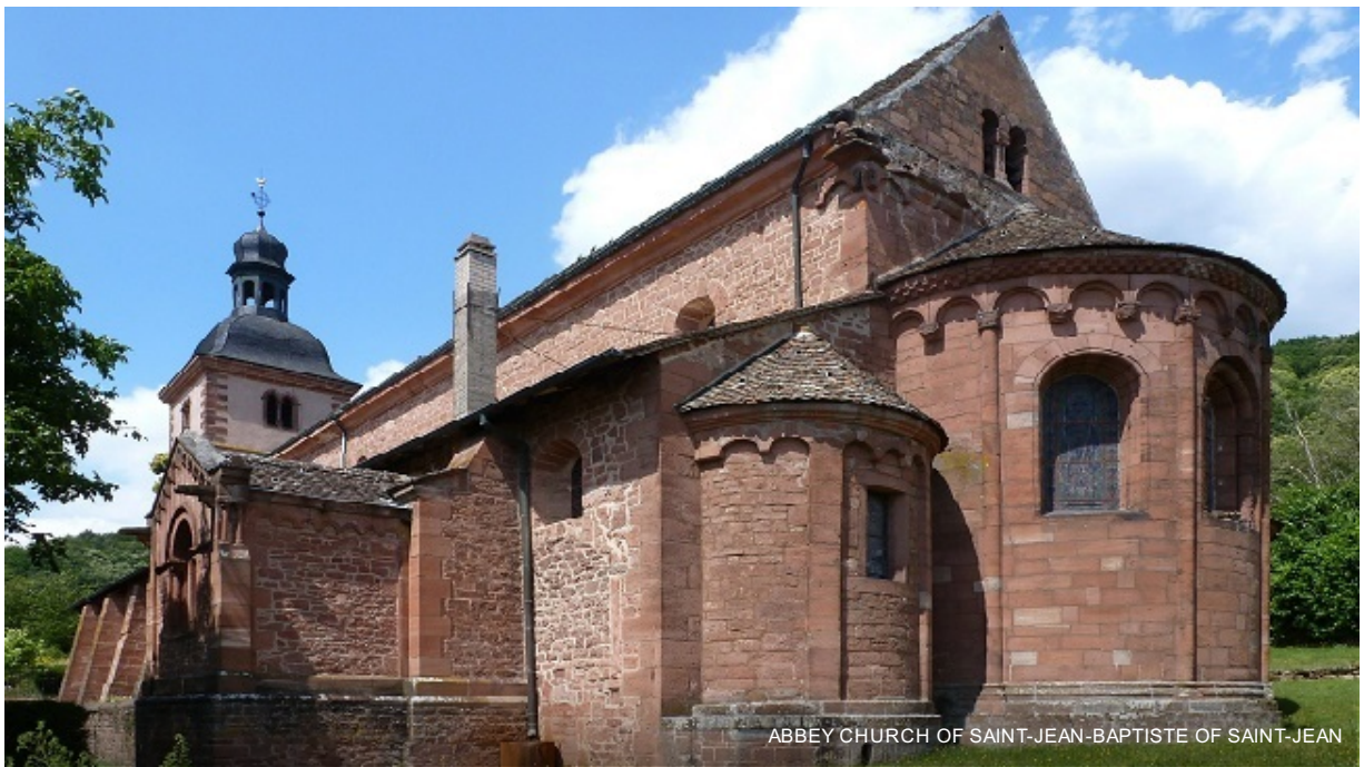
ABBEY CHURCH OF SAINT-JEAN-BAPTISTE OF SAINT-JEAN