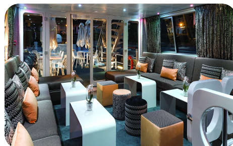
MS Madeleine Barge Cruise