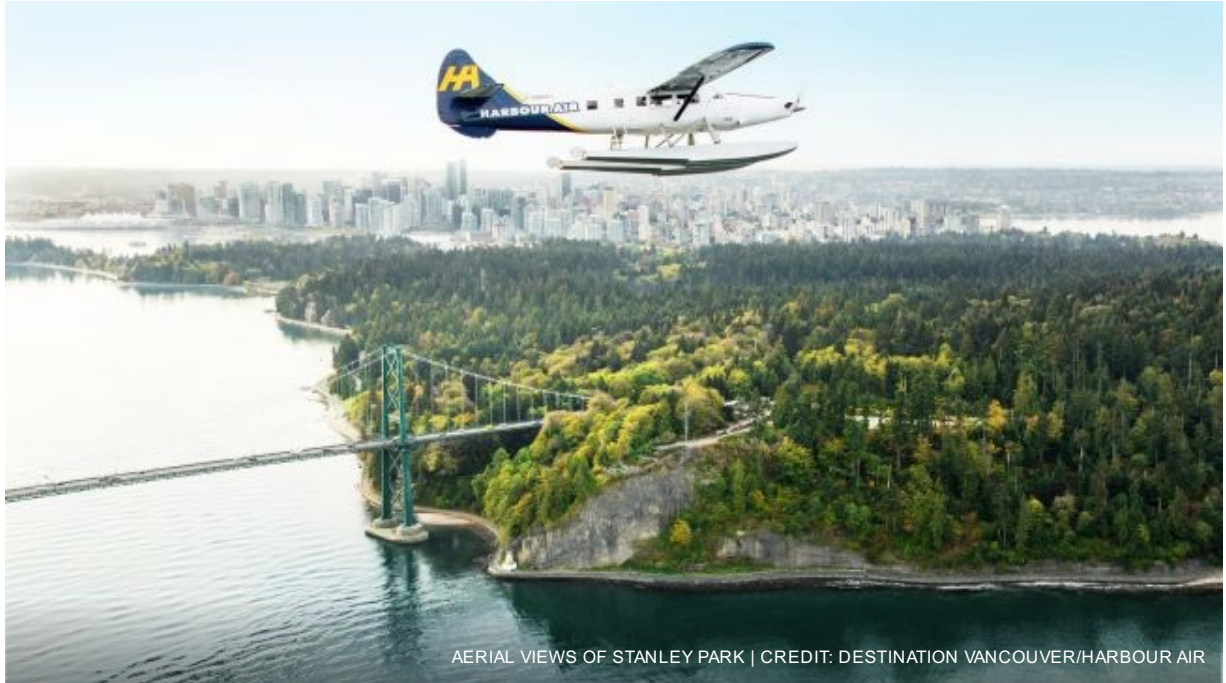
AERIAL VIEWS OF STANLEY PARK

Overnight in Vancouver at the Sheraton Vancouver Wall Centre