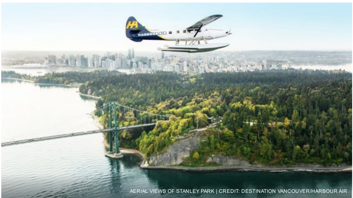
AERIAL VIEWS OF STANLEY PARK | CREDIT: DESTINATION VANCOUVER/HARBOUR AIR

Overnight in Vancouver at the Sheraton Vancouver Wall Centre