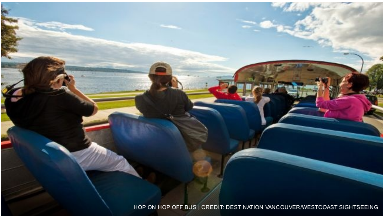
HOP ON HOP OFF BUS