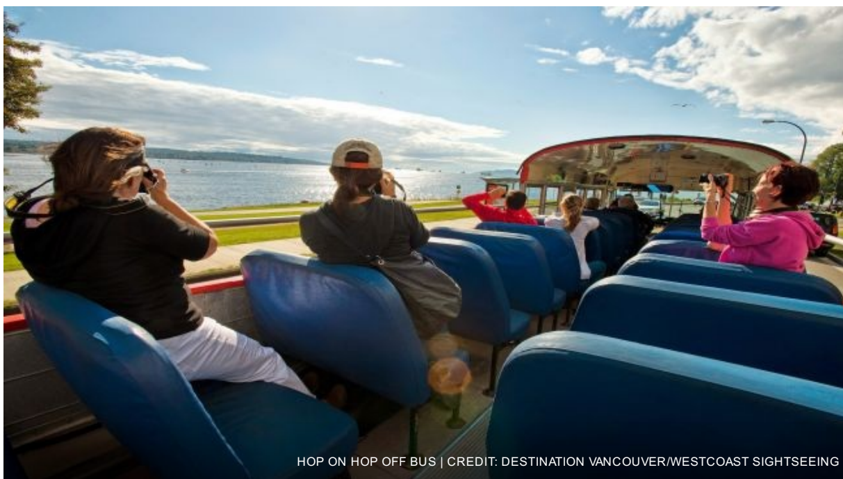
HOP ON HOP OFF BUS

Overnight in Vancouver at the Sheraton Vancouver Wall Centre