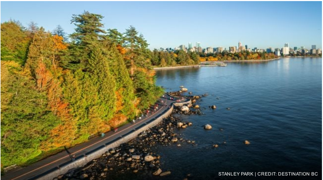
STANLEY PARK