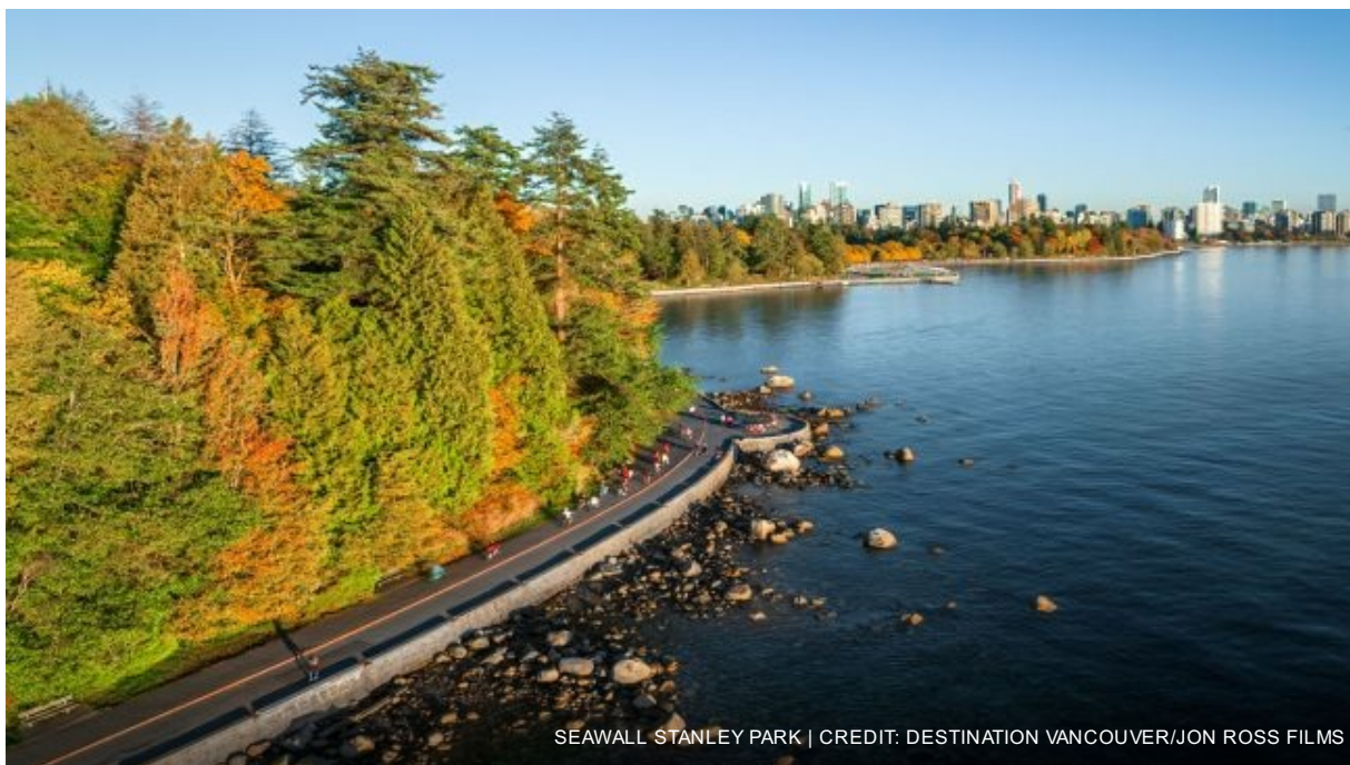
SEAWALL STANLEY PARK

Overnight in Vancouver at the Rosedale on Robson Suite Hotel