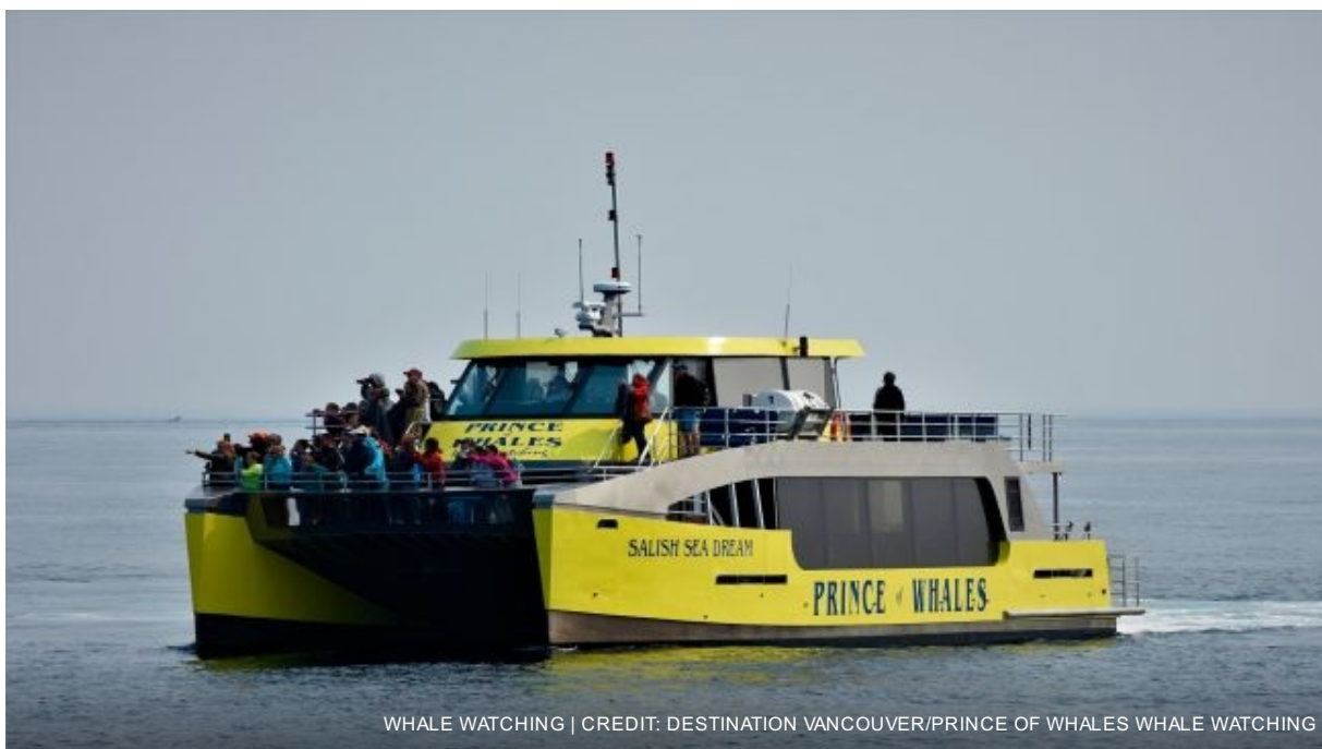
WHALE WATCHING

Overnight in Vancouver at the Rosedale on Robson Suite Hotel