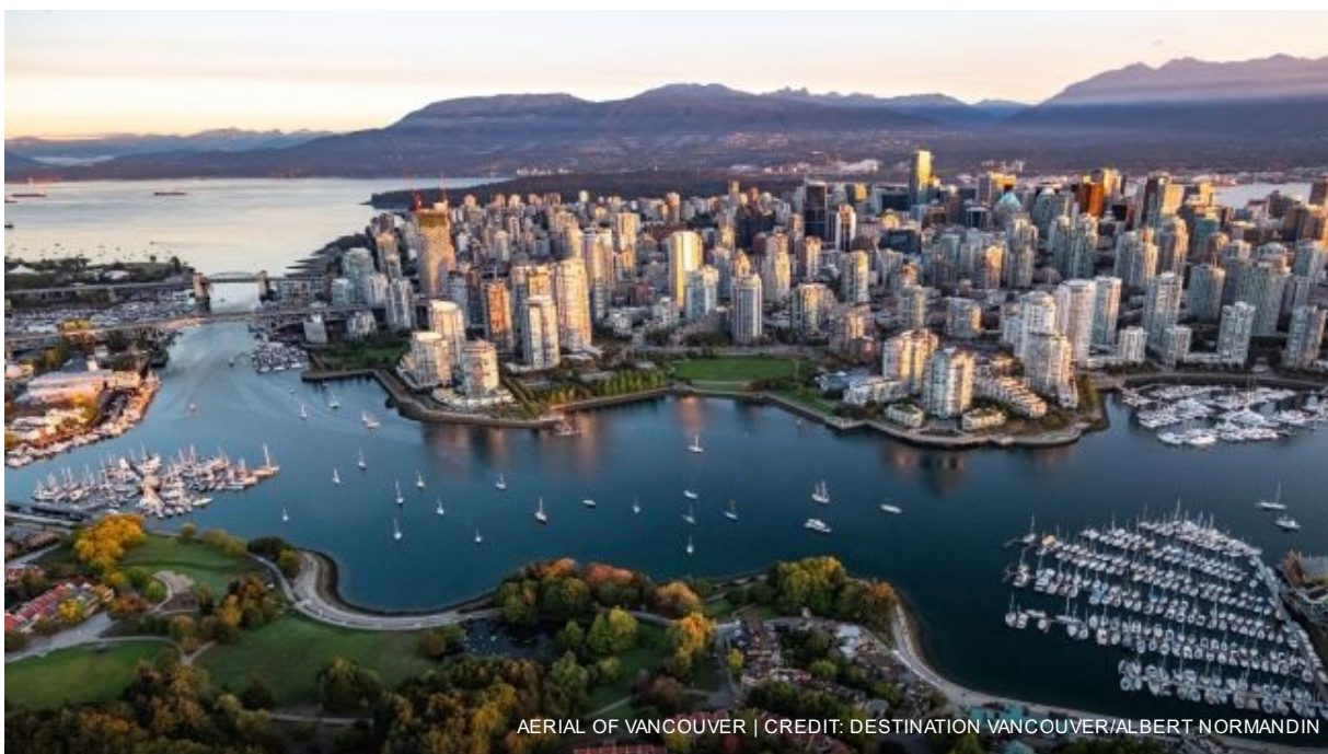
AERIAL OF VANCOUVER

Overnight in Vancouver at the Rosedale on Robson Suite Hotel