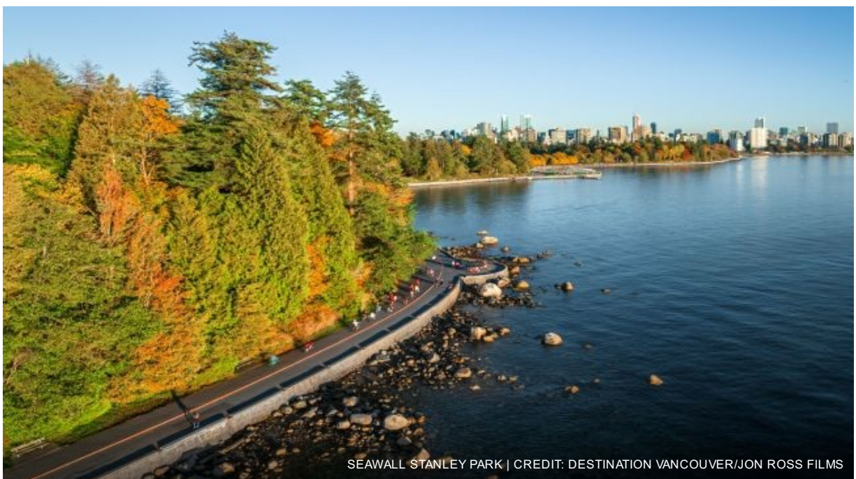
SEAWALL STANLEY PARK

Overnight in Vancouver at the Rosedale on Robson Suite Hotel