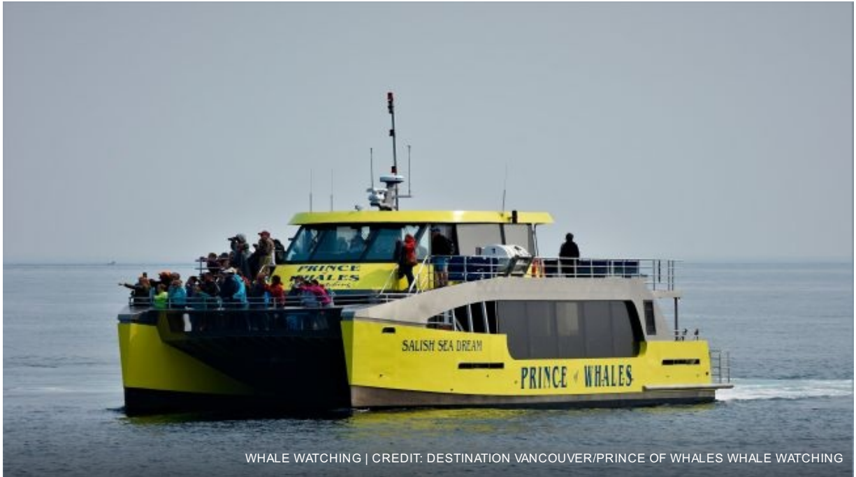
WHALE WATCHING

Overnight in Vancouver at the Rosedale on Robson Suite Hotel