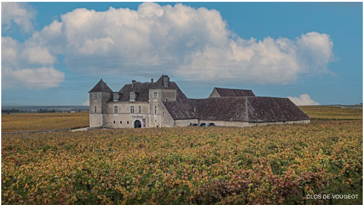
CLOS DE VOUGEOT