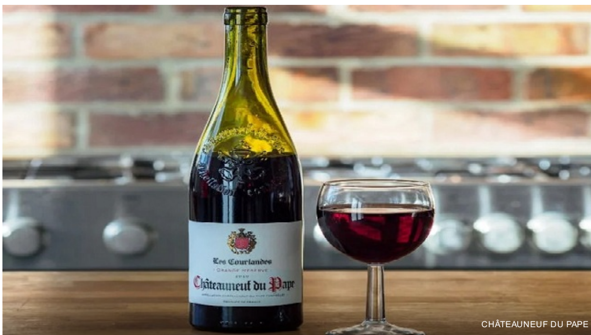
CHÂTEAUNEUF DU PAPE