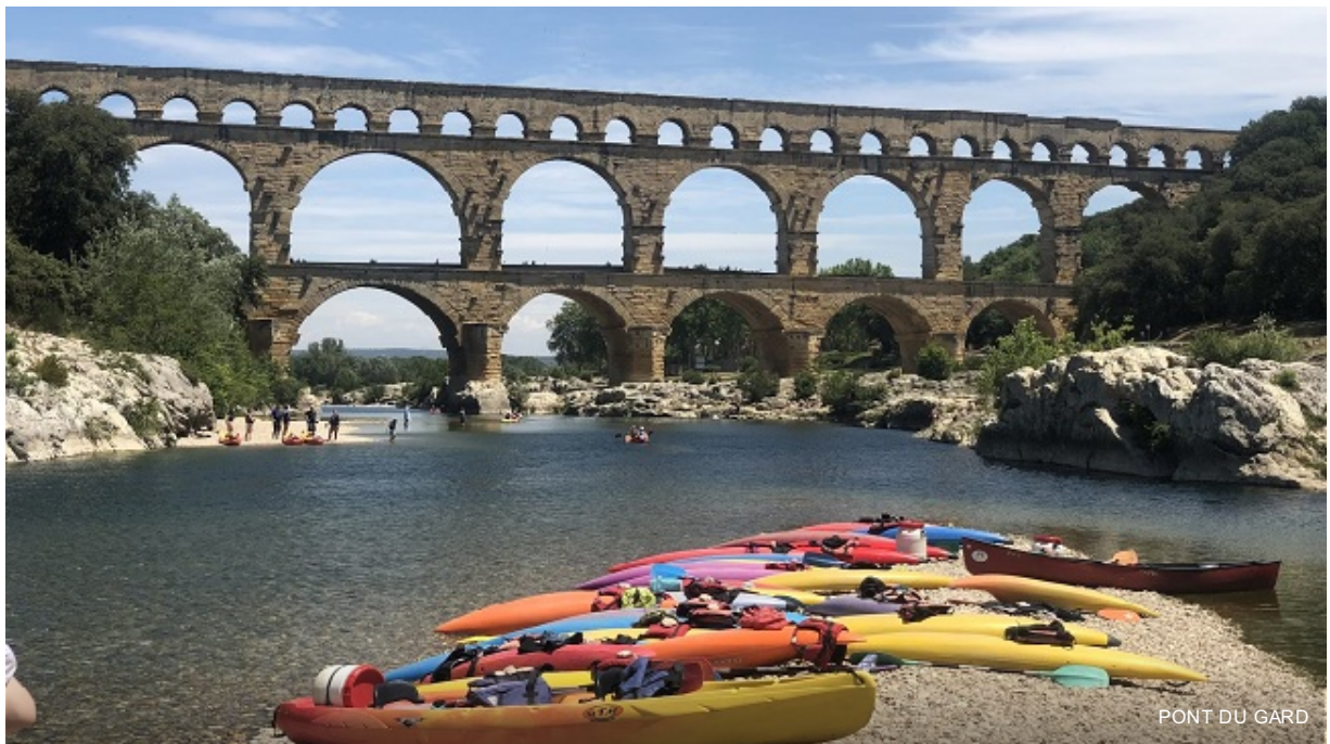
PONT DU GARD