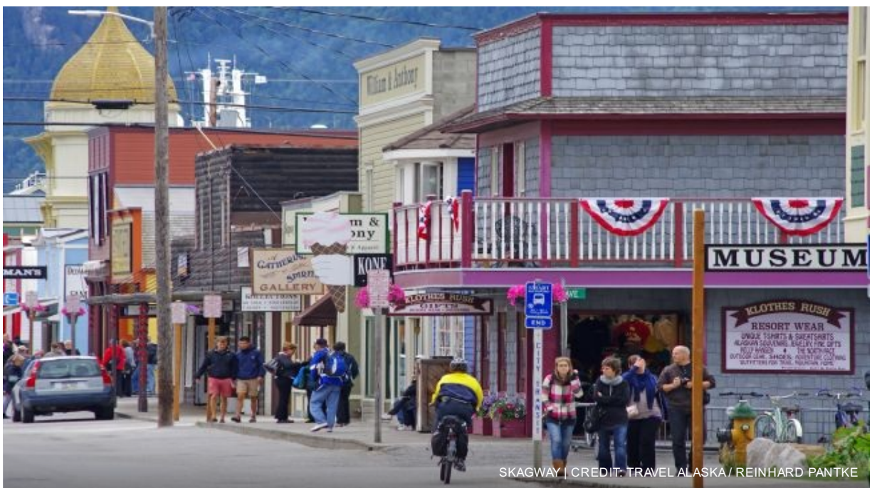
SKAGWAY | CREDIT: TRAVEL ALASKA / REINHARD PANTKE