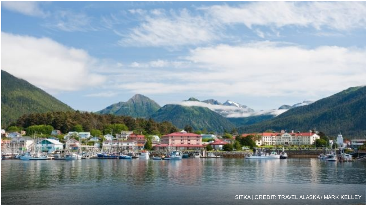
SITKA