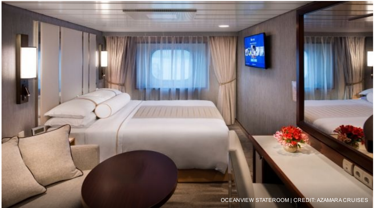
OCEANVIEW STATEROOM