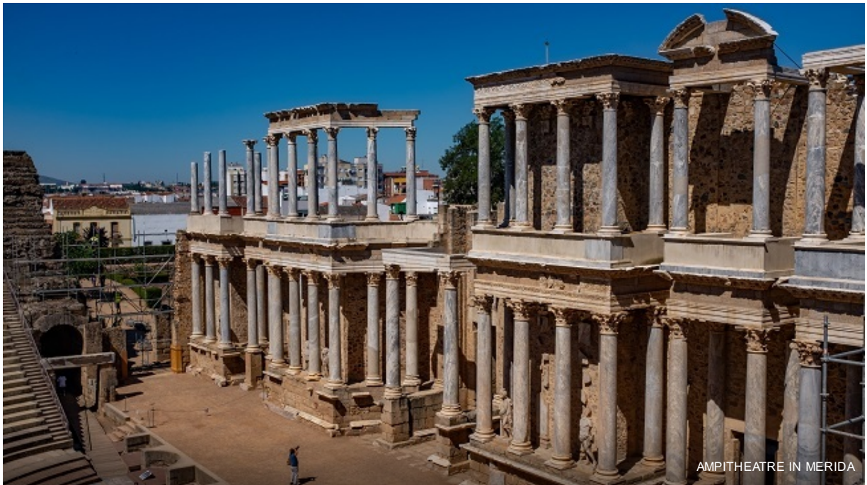
AMPITHEATRE IN MERIDA