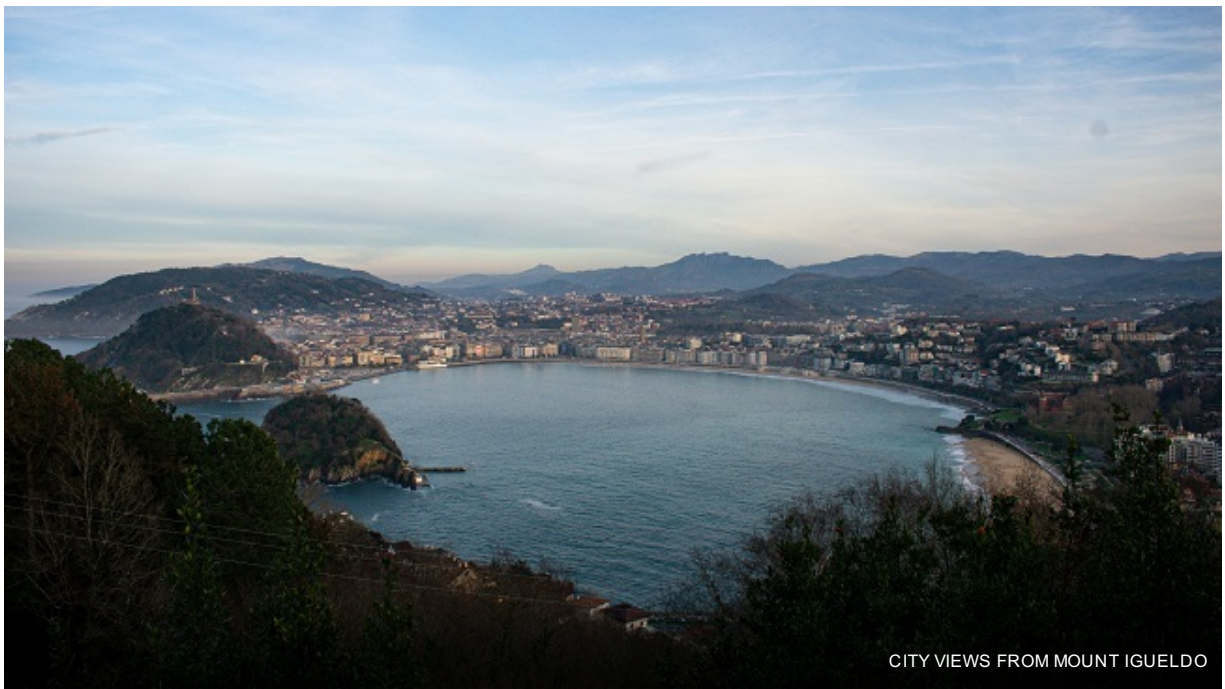
CITY VIEWS FROM MOUNT IGUELDO