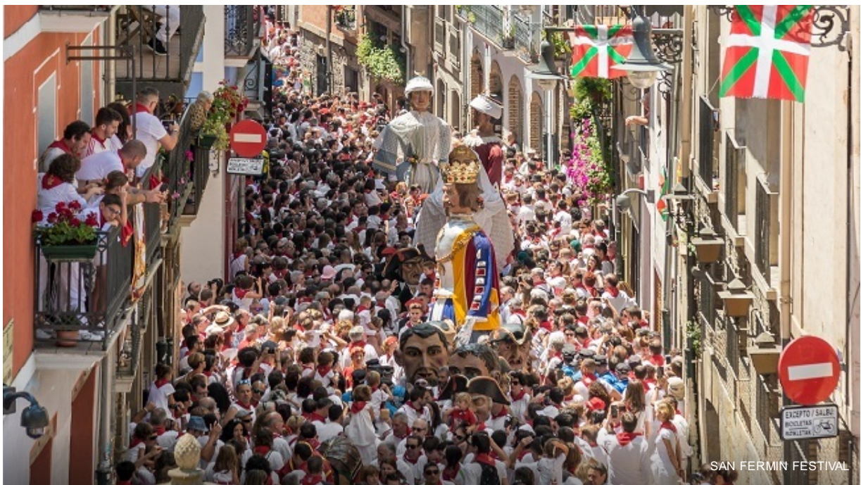
SAN FERMIN FESTIVAL

Breakfast at the hotel. Take a Bilbao city tour and discover its most recent developments. Time at leisure for you to explore the esplanade where The Guggenheim Museum is located in order for you to admire this modern architectural building.