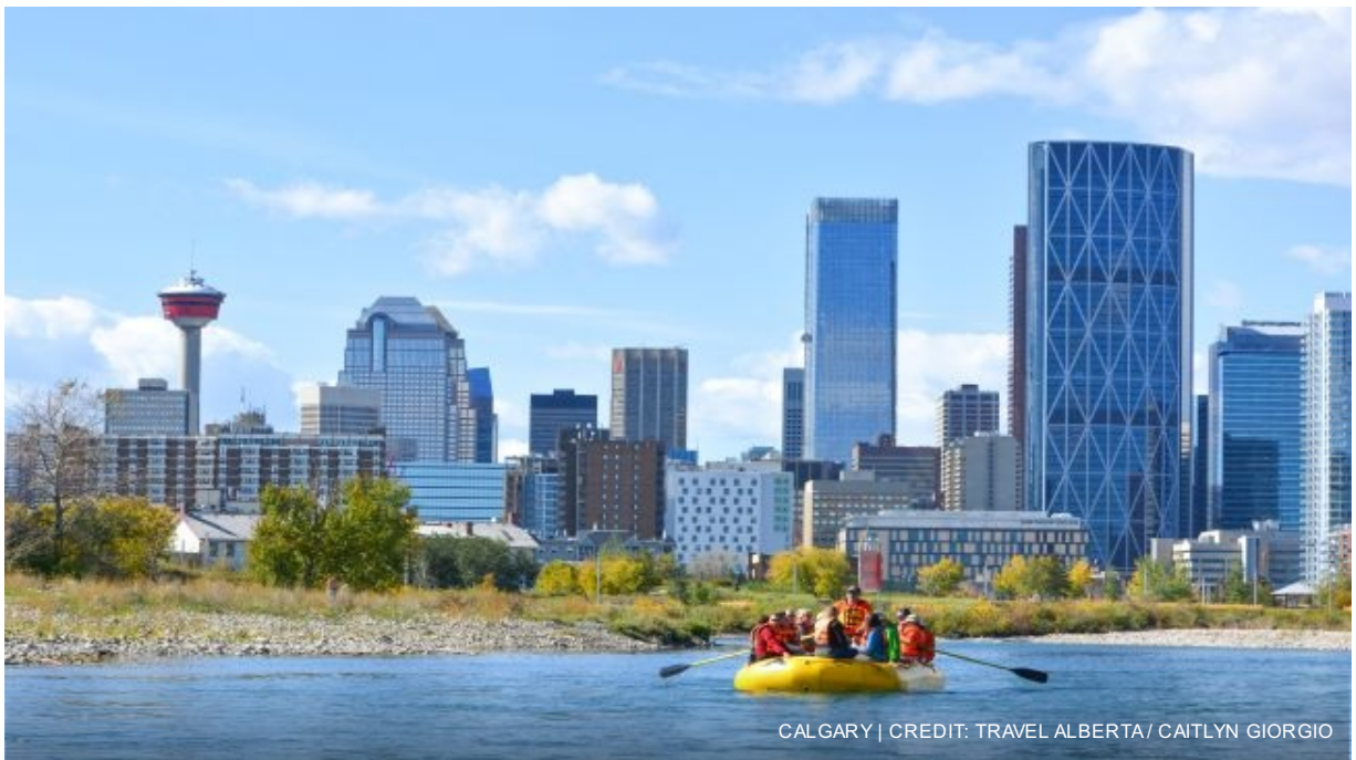
CALGARY