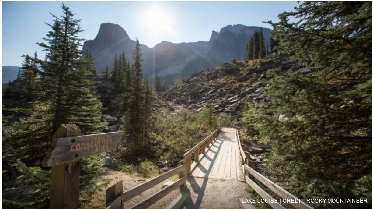
LAKE LOUISE

Overnight in Lake Louise at Fairmont Chateau Lake Louise