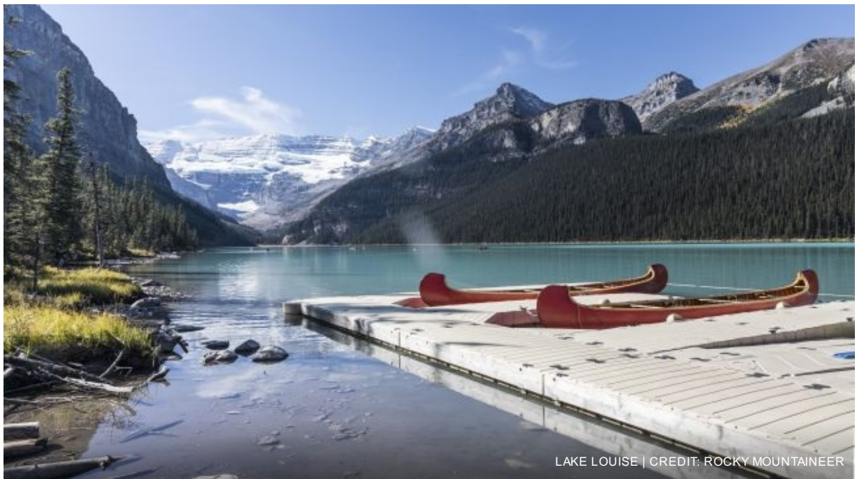
LAKE LOUISE

Overnight in Lake Louise at Fairmont Chateau Lake Louise