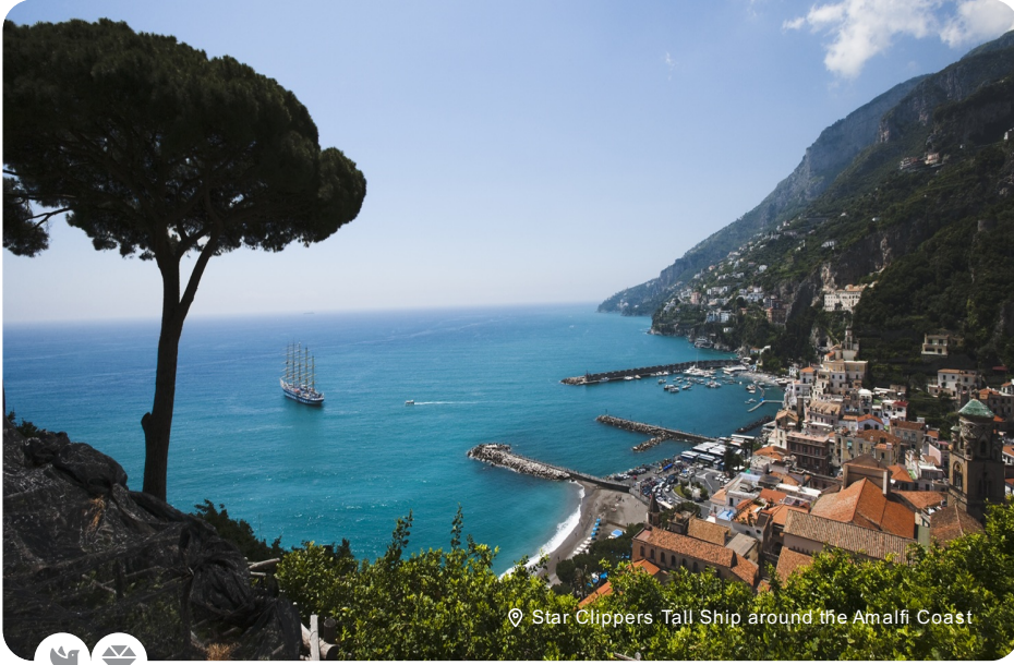
Star Clippers Tall Ship around the Amalfi Coast