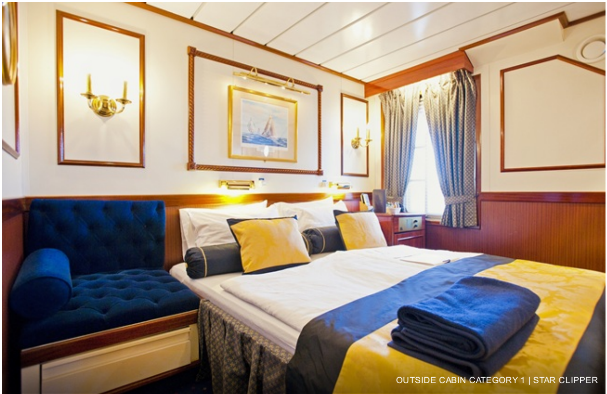
OUTSIDE CABIN CATEGORY 1 | STAR CLIPPER

pools, open-seating dining, a Tropical Bar, Piano Bar, and an Edwardian-style library. The décor evokes the grand age of sail with antique prints, paintings, and gleaming mahogany rails.