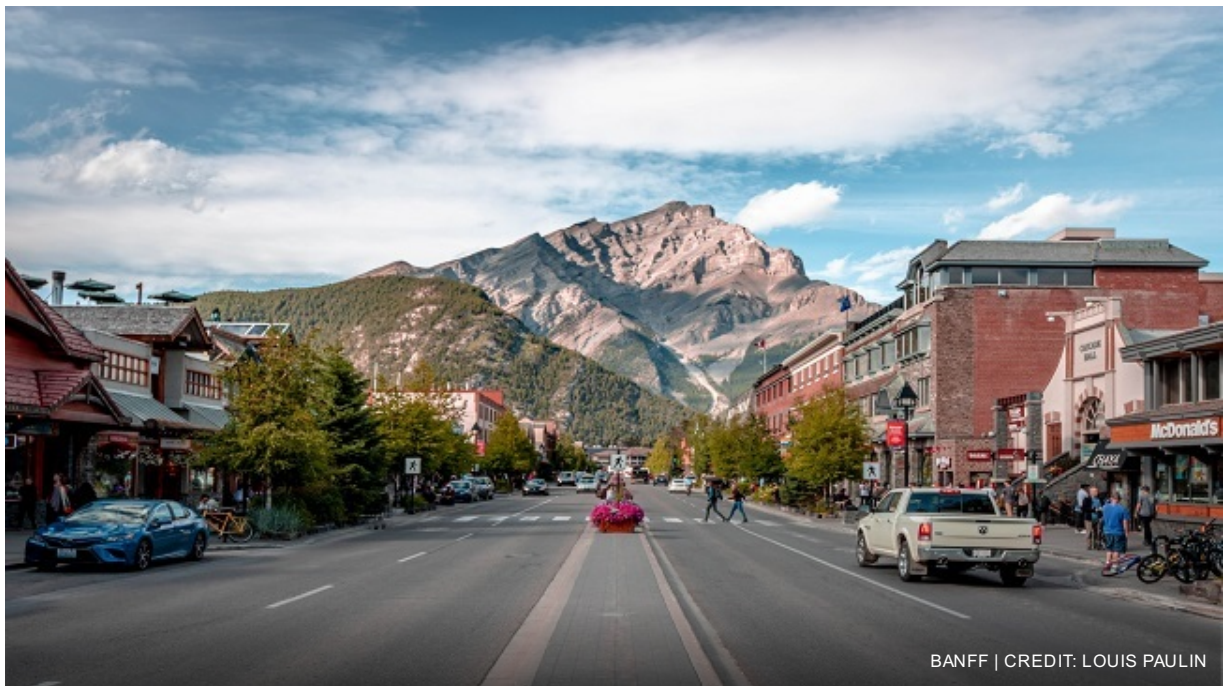
BANFF

Overnight in Banff at the Rimrock Resort