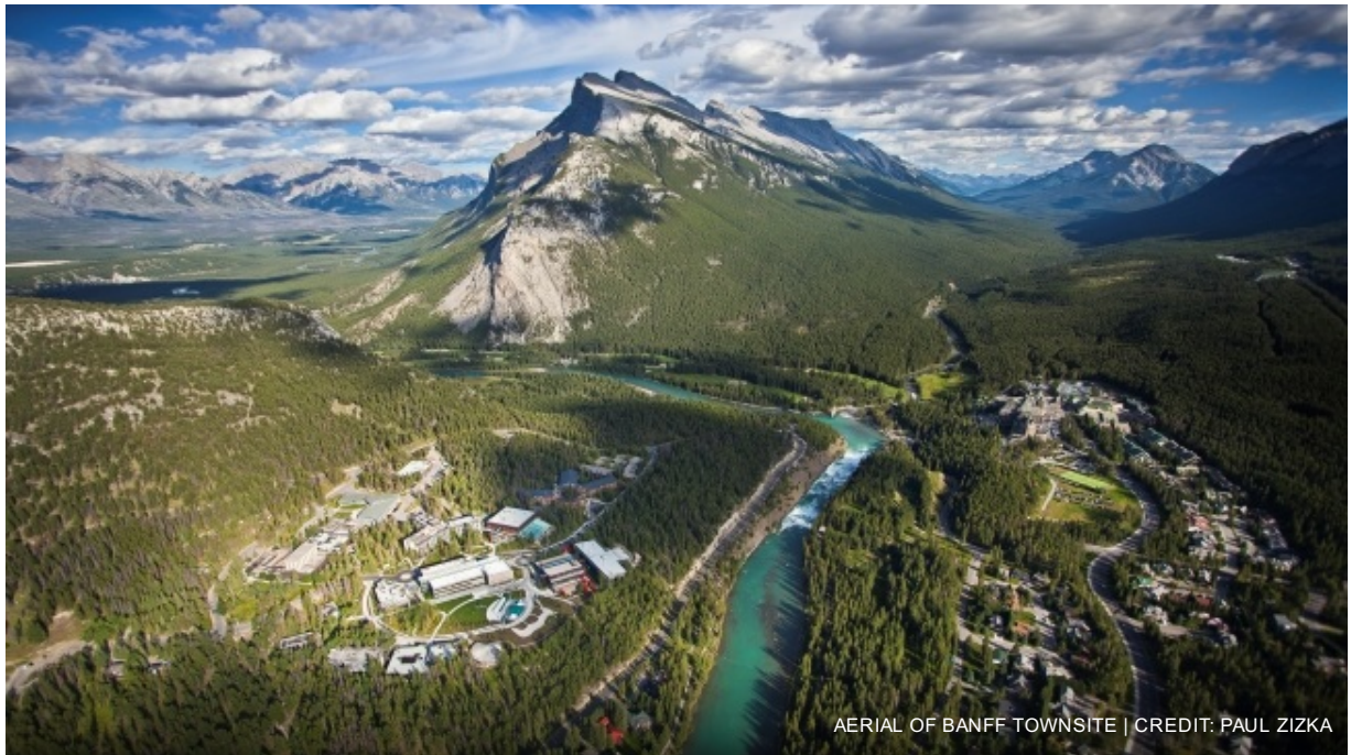
AERIAL OF BANFF TOWNSITE

Overnight in Banff at the Rimrock Resort