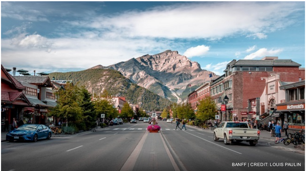
BANFF

Overnight in Banff at the Rimrock Resort