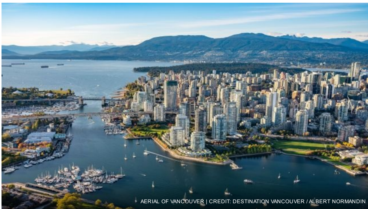
AERIAL OF VANCOUVER

views of the mountains and the Lions Gate Bridge. Take in the jaw-dropping 360-degree view of the city and beyond from Vancouver Lookout's Observation Deck, and wander through the charming farmer's market at Granville Island.