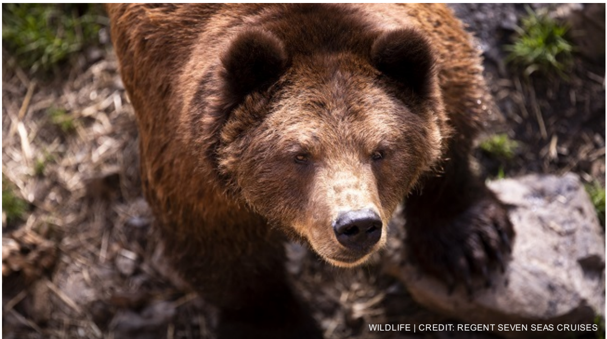
WILDLIFE | CREDIT: REGENT SEVEN SEAS CRUISES