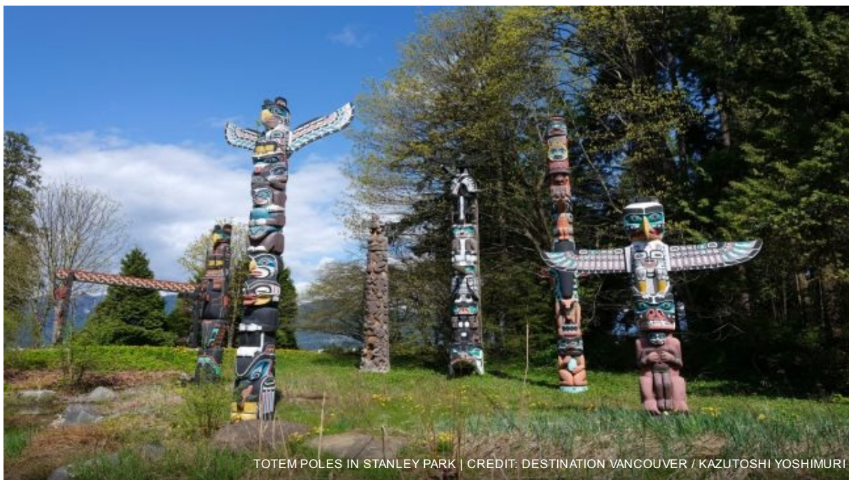
TOTEM POLES IN STANLEY PARK

Overnight in Vancouver at the Fairmont Hotel Vancouver