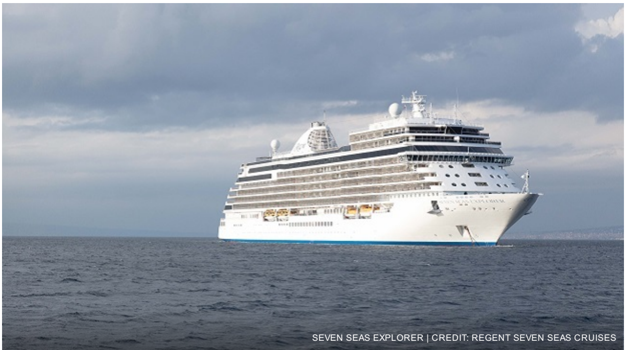
SEVEN SEAS EXPLORER