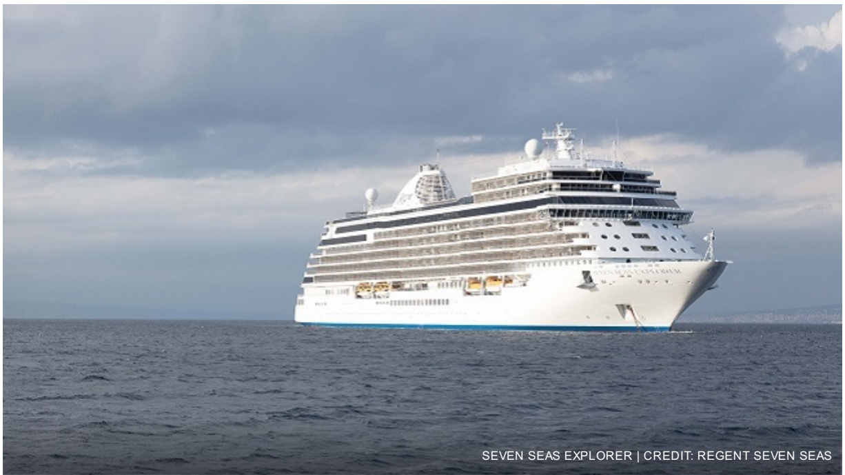
SEVEN SEAS EXPLORER