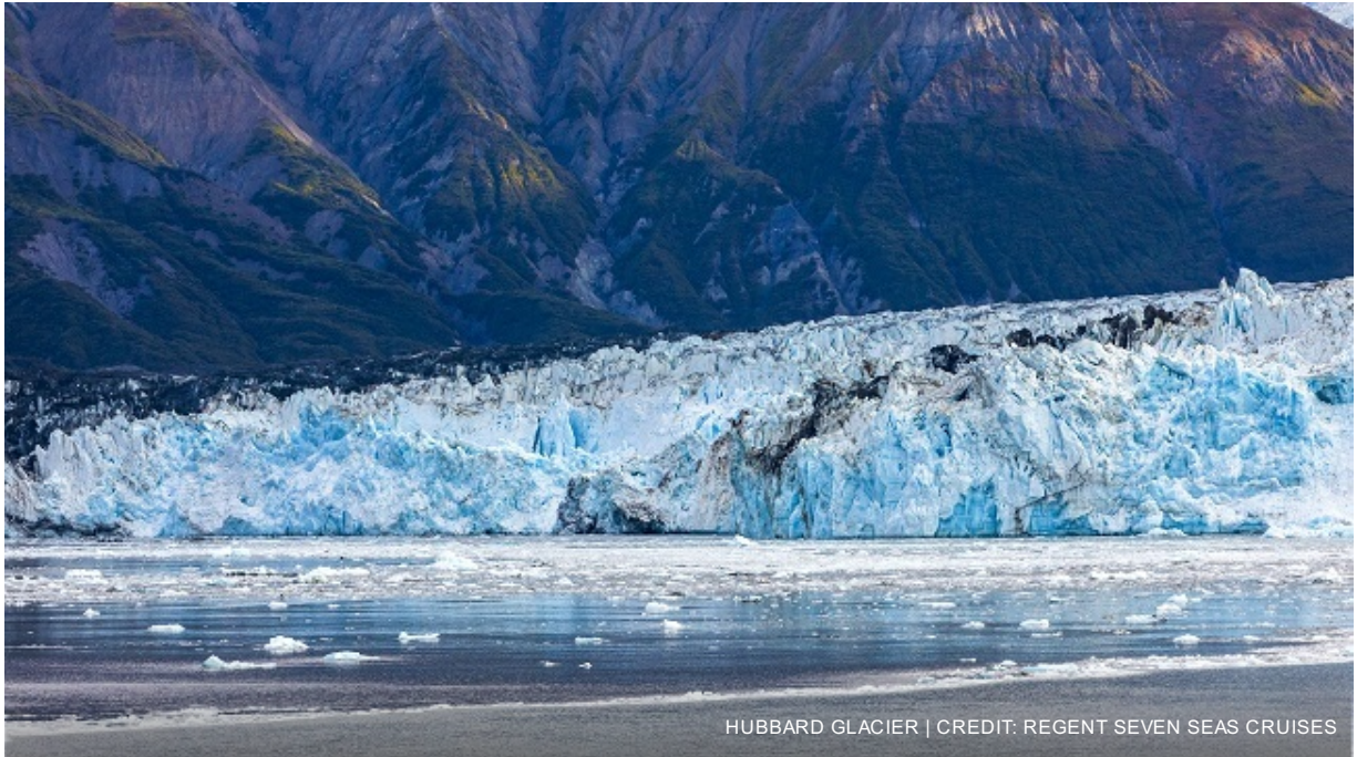
HUBBARD GLACIER