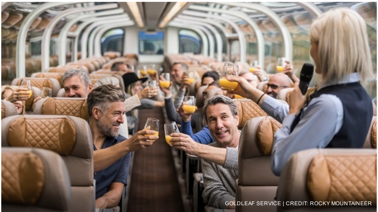
GOLDLEAF SERVICE