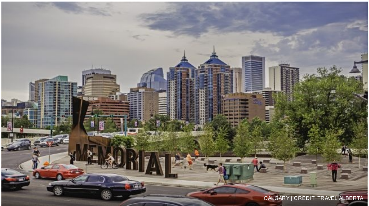
CALGARY | CREDIT: TRAVEL ALBERTA

Overnight in Calgary at Fairmont Palliser