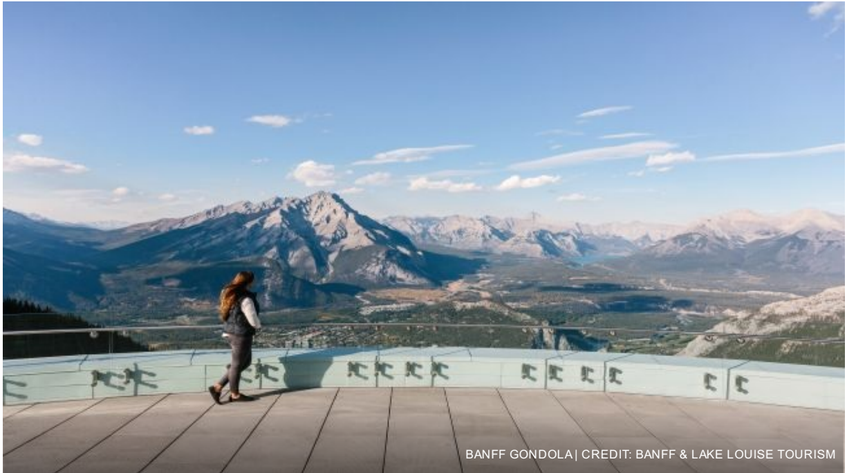
BANFF GONDOLA