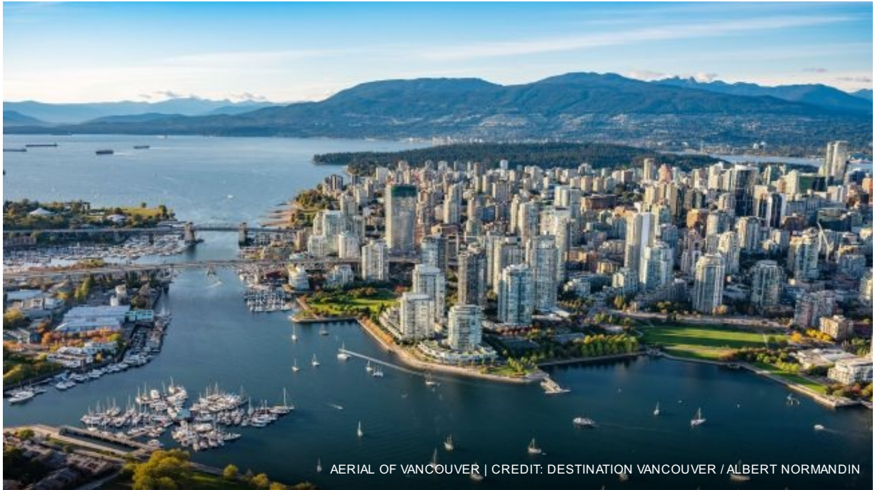
AERIAL OF VANCOUVER