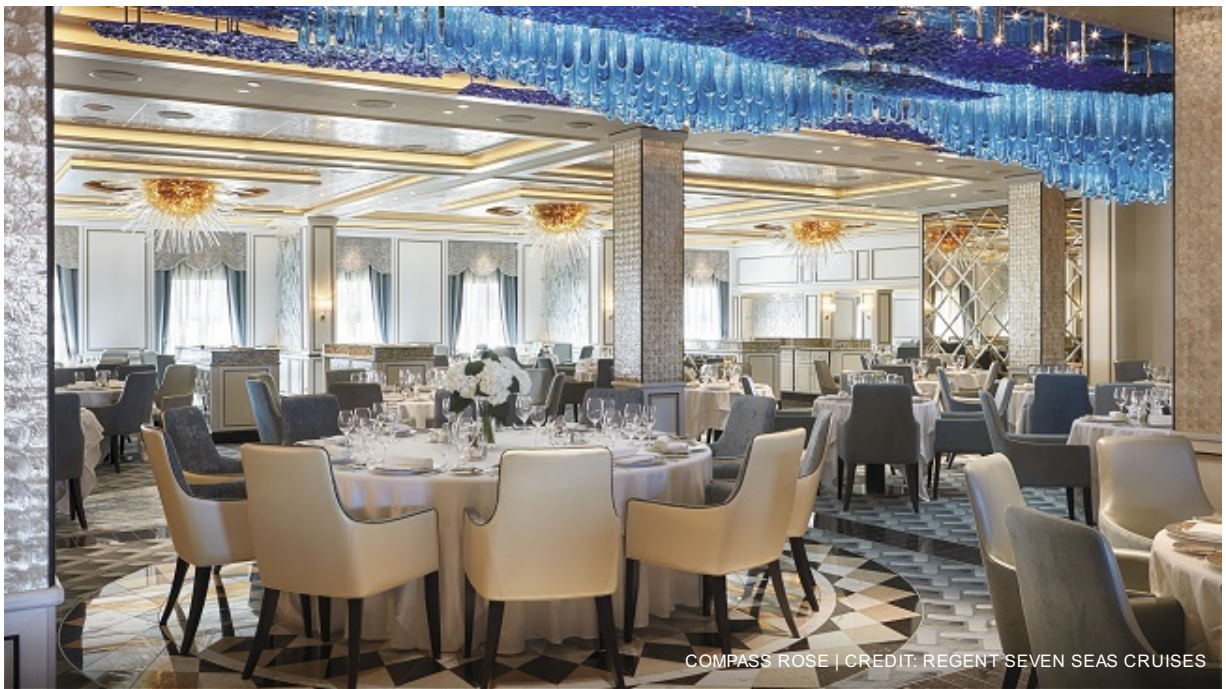
COMPASS ROSE