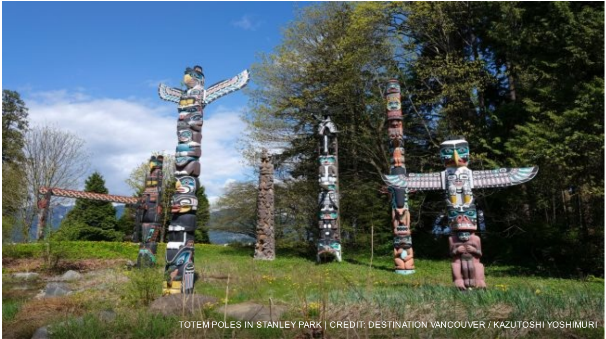
TOTEM POLES IN STANLEY PARK