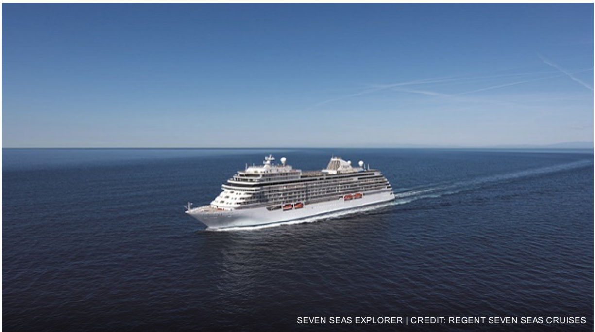
SEVEN SEAS EXPLORER