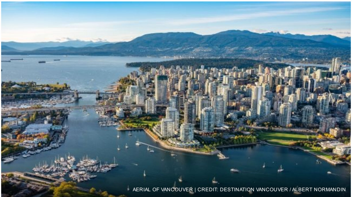
AERIAL OF VANCOUVER

Overnight in Vancouver at Fairmont Waterfront