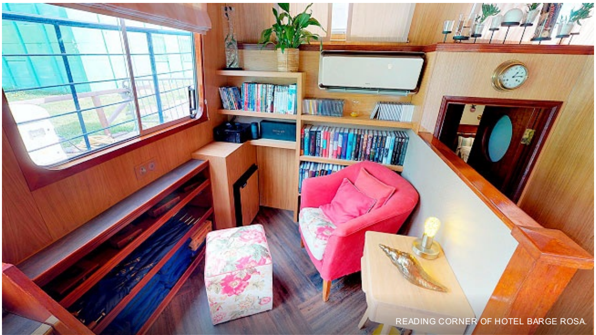
READING CORNER OF HOTEL BARGE ROSA.