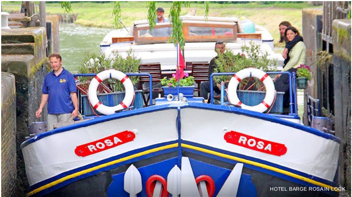
HOTEL BARGE ROSAIN LOCK.