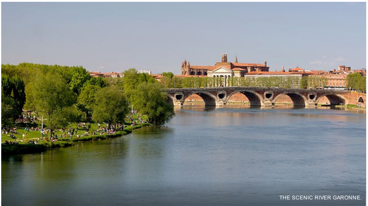
THE SCENIC RIVER GARONNE.