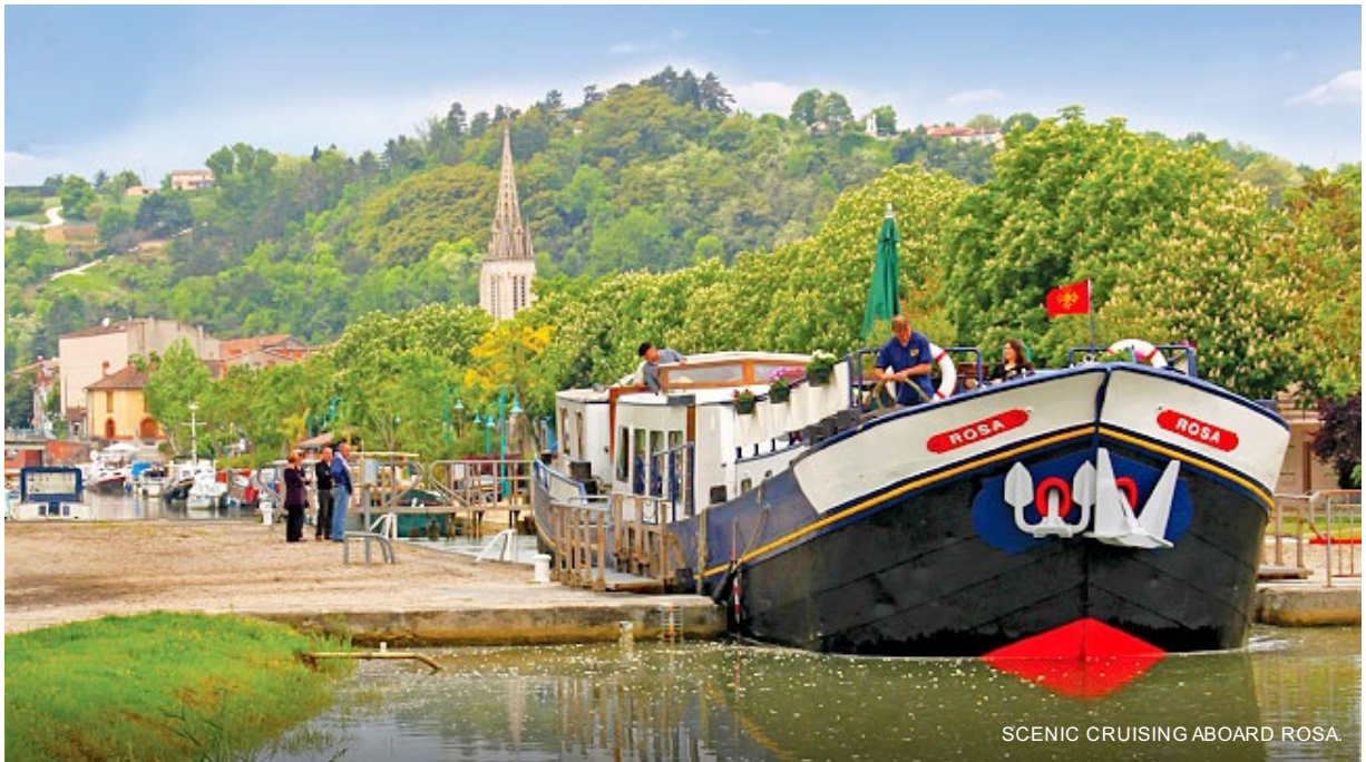
SCENIC CRUISING ABOARD ROSA.