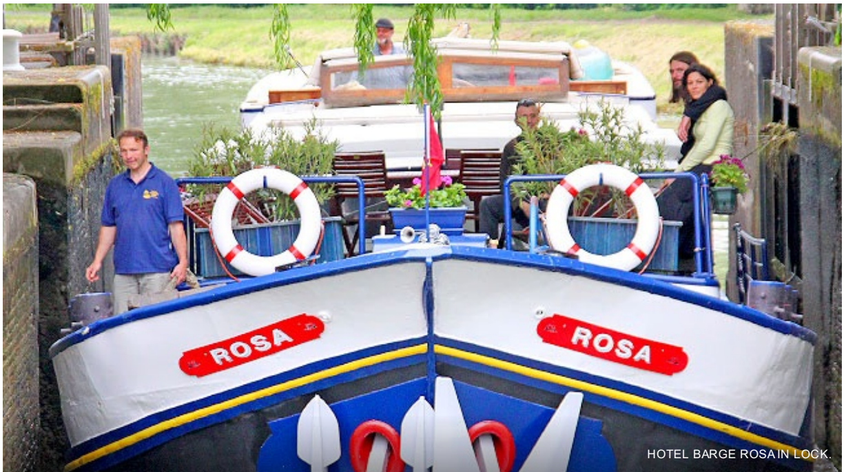
HOTEL BARGE ROSAIN LOCK.