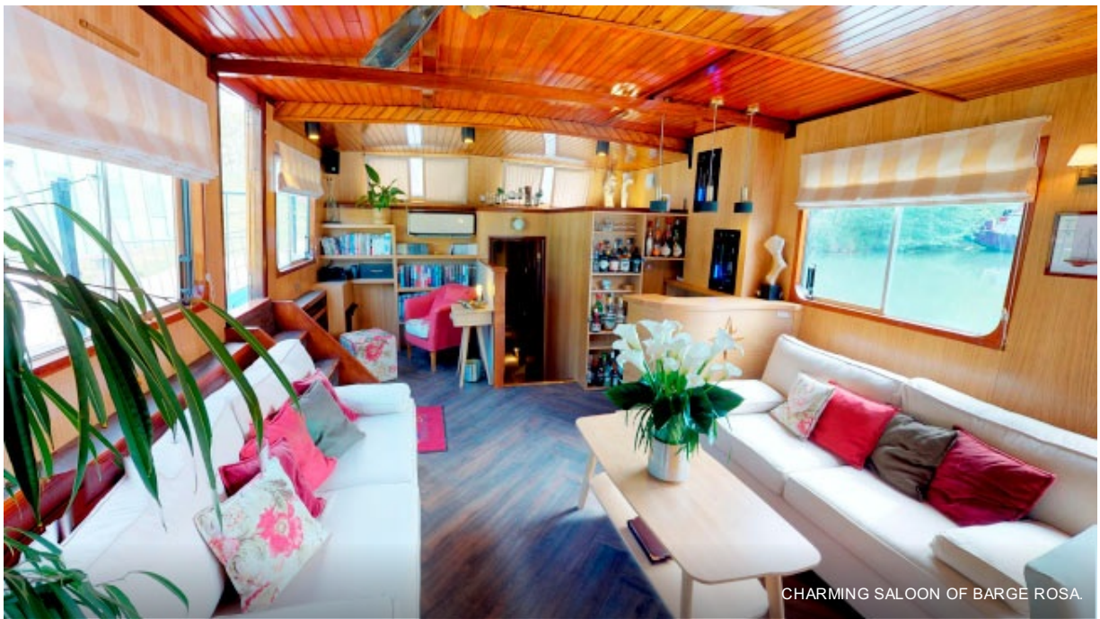
CHARMING SALOON OF BARGE ROSA.