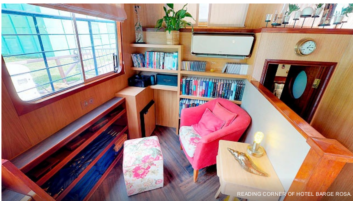
READING CORNER OF HOTEL BARGE ROSA.