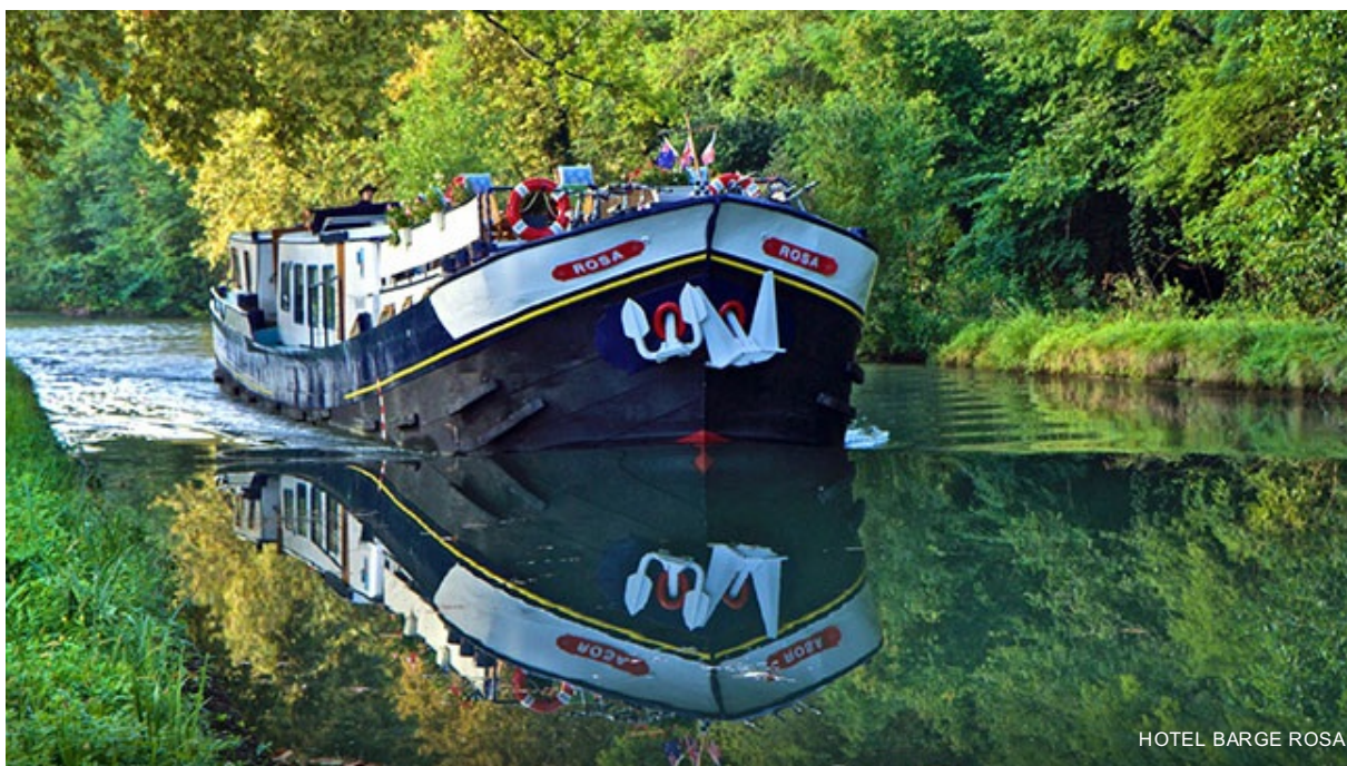
HOTEL BARGE ROSA