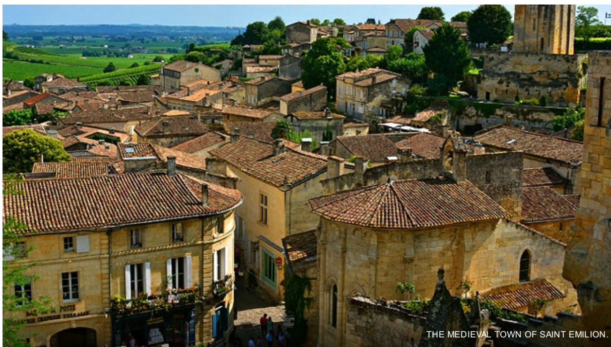
THE MEDIEVAL TOWN OF SAINT EMILION.